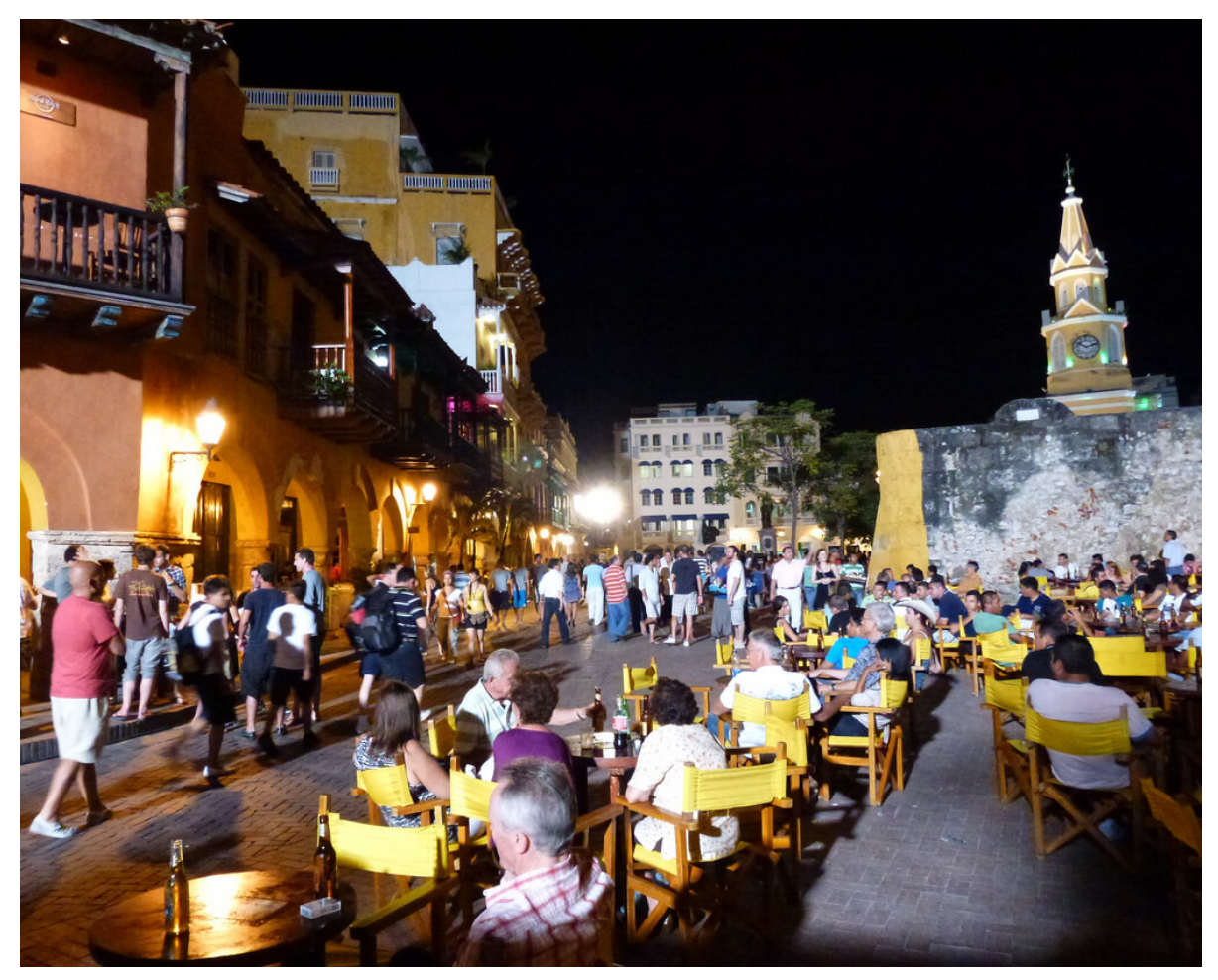
It might be 85 at night, but it's perfect for a drink and some people watching