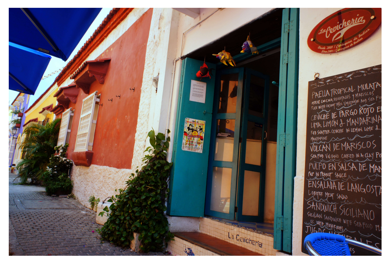
Eat here. I beg of you.

2. You can get lost, and enjoy it too: The streets are meandering here, the street signs are hard to see, and for the most part, there's no way to figure out from a faraway waypoint where you are. But this is all ok here in Cartagena. Much like other older cities around the world (Marrakech in Morroco, The Old City in Barcelona, Casco Viejo in Panama) you tend to walk down a meandering road and not know where you're going, but there's something fun and interesting happening around every corner here and you won't ever get bored or actually feel lost. The walls are colorful, there's a million smells, and this is a place where time slows down and you can enjoy just getting lost.