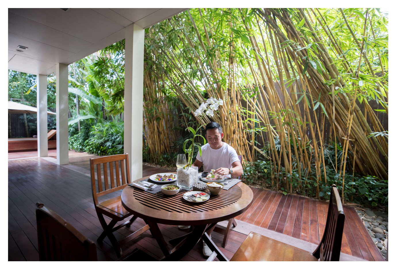
Room service on the patio? Count me in