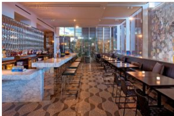
The lobby restaurant is gorgeous AND expensive

The hotel itself is a smaller property, but that’s because the Andaz believes that this property is all about the location around it and they don’t expect you to spend a lot of time within the hotel. There is a restaurant on the side of the lobby, which is beautiful, but rather expensive. It’s not a bad place to grab a bite, but I would recommend checking out everything else that Los Angeles has to offer – it IS the foodie capital of the US.