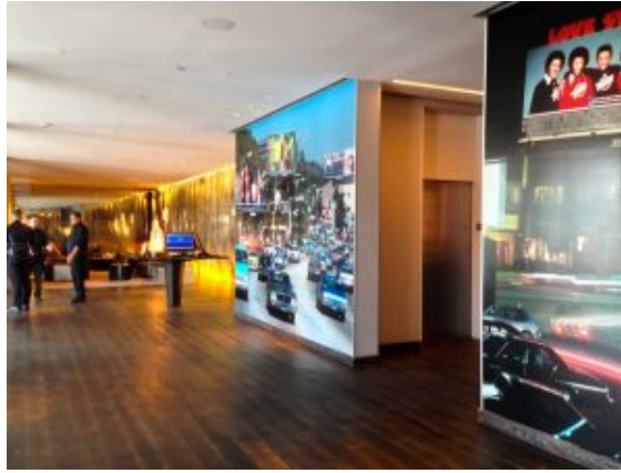
The minimalist lobby, notice the check-in “stands” in the distance

The hotel itself is a smaller property, but that’s because the Andaz believes that this property is all about the location around it and they don’t expect you to spend a lot of time within the hotel. There is a restaurant on the side of the lobby, which is beautiful, but rather expensive. It’s not a bad place to grab a bite, but I would recommend checking out everything else that Los Angeles has to offer – it IS the foodie capital of the US.