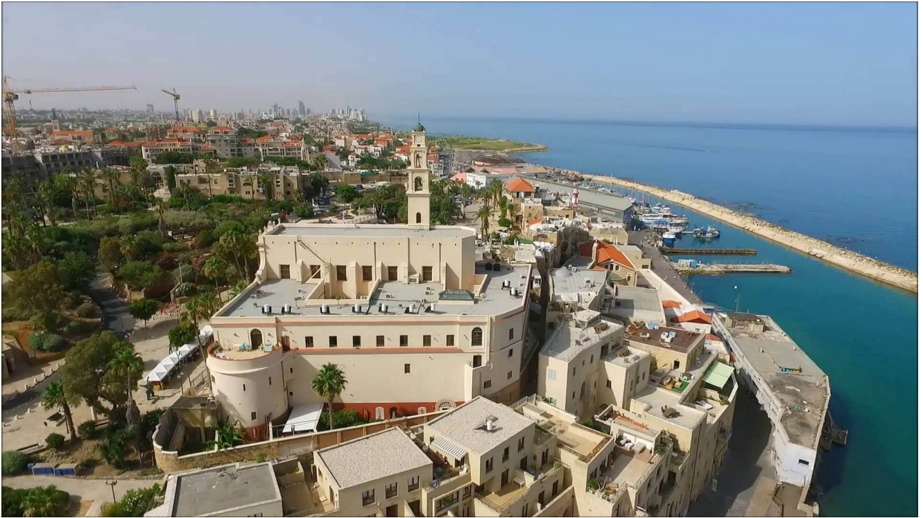
Jaffa Heights from my Drone's view

After quite a bit of walking and filming I realized that my next stop had to be for more food. After consulting Tripadvisor (which can be hit or miss – but still useful), I decided upon a place called “Ha’Pizza”. I had found based on my past few days in Jerusalem, that oddly enough – the Pizza in Israel was possibly as good or better than some of the best Neapolitan pizza i’ve had in the US in Brooklyn. I was told that this was because of the unique soil in the region and the resulting freshness of the grown tomatoes. As to whether this is true or not I’m not sure, but the pizza was damn good.