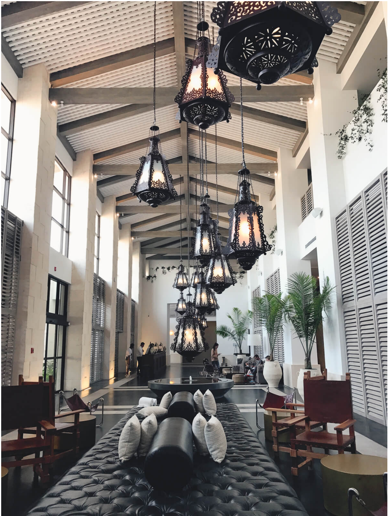
Luxury unveiled the minute you walk in