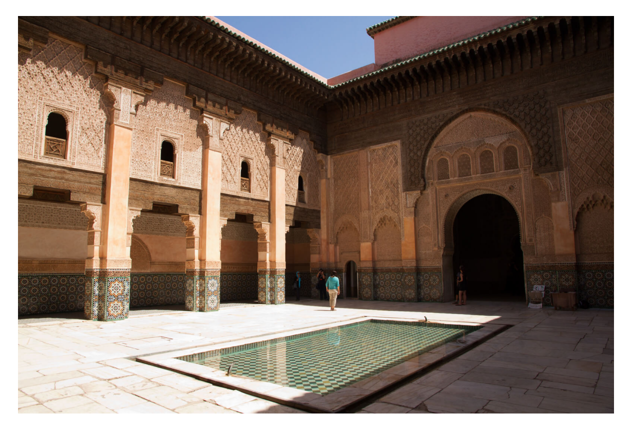
The architecture here is worth the visit.

4. Le Jardin Secret: This garden is similar to Jardin Majorelle, but in my opinion is a better visit because it's less crowded and has a really cool belltower that is worth going to the top of to get a view of the Medina and surrounding neighborhood. The garden is composed of two large courtyards lined with beautiful foliage and a few spaces with artwork and other rotating exhibits.