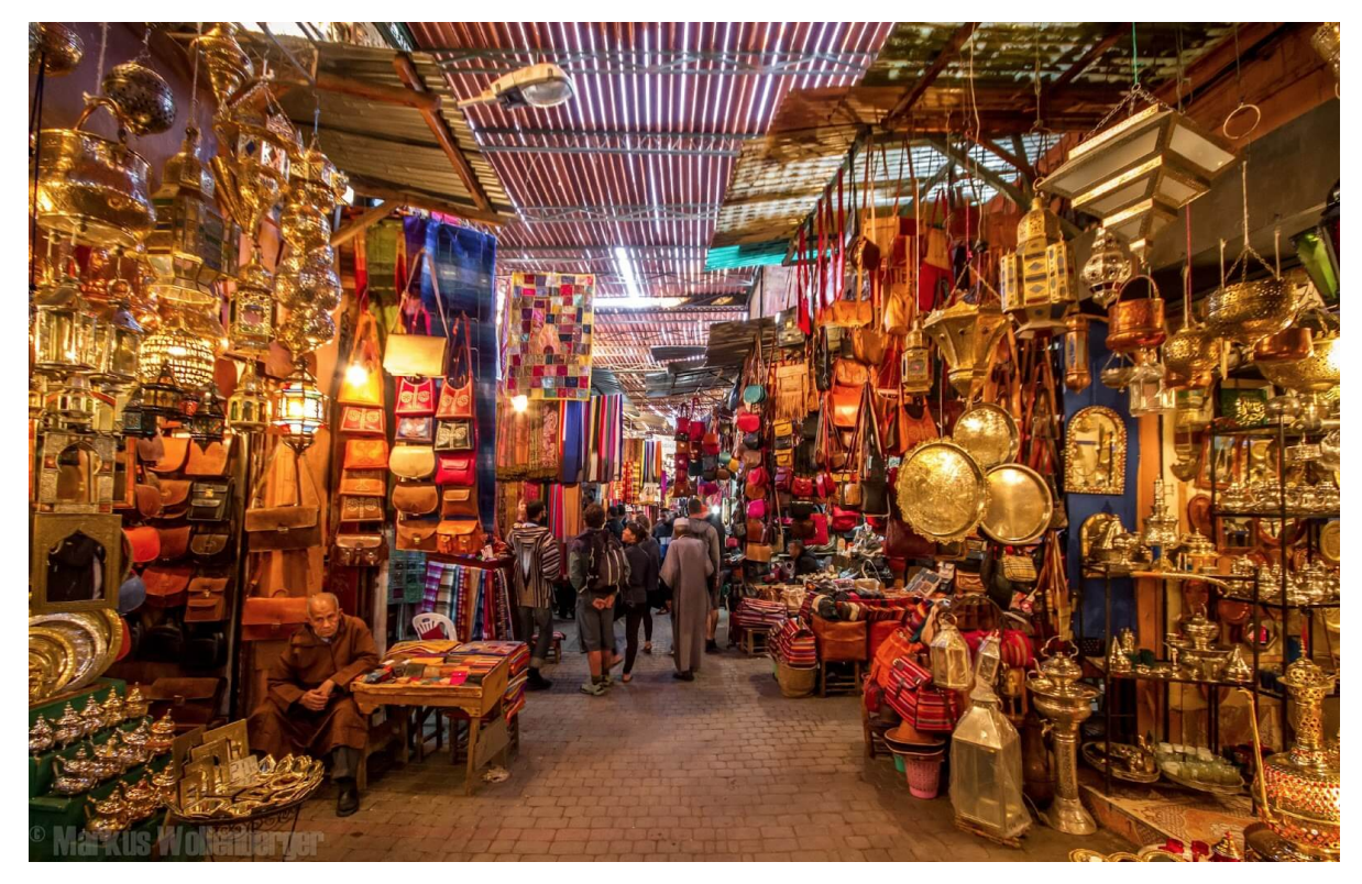
The spiderweb of coridors in the Medina is a place you'll spend hours exploring

2. Jemaa Al Fnaa: This is the square of the Medina, and if you haven't seen enough in the Souk's of the Medina you'll also spend some time here, this is also where the famous snake shows are along with numerous other vendors selling almost anything you can think of that's local to Morocco. You won't need much time here, but it's worth looking at. In the summer's I'd recommend coming here at night because during the day time it is ridiculously hot and not many vendors will be around.