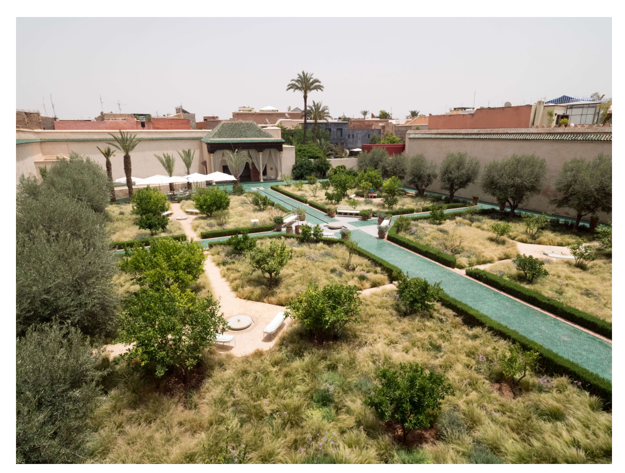
The larger of the two courtyards in Le Jardin Secret

5. La Mamounia Spa: This is the famous spa and hotel that everyone in Morocco takes pictures at when they're visiting Marrakech. I got spa services for myself, and can't say they were really that great, but the spa and property boast some really intricate moorish interior design and architecture. You can pay for a cheap day pass here to use the pools (indoor and outdoor), and I highly recommend it.