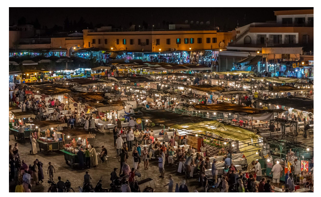
The center of the Medina is a marketplace that is an all day attraction

3. Ben Youssef Madrasa: This was one of the first Islamic College's constructed over 1000 years ago. It's an interesting place to visit as architecturally everything is built geometrically symmetrical, and the ornate work done by the builders is evident as the place looks as pristine as if it were built yesterday. This is right next to the Medina and doesn't take more than 10-15 minutes to look at so I wouldn't allocate too much time but I would certainly drop by.