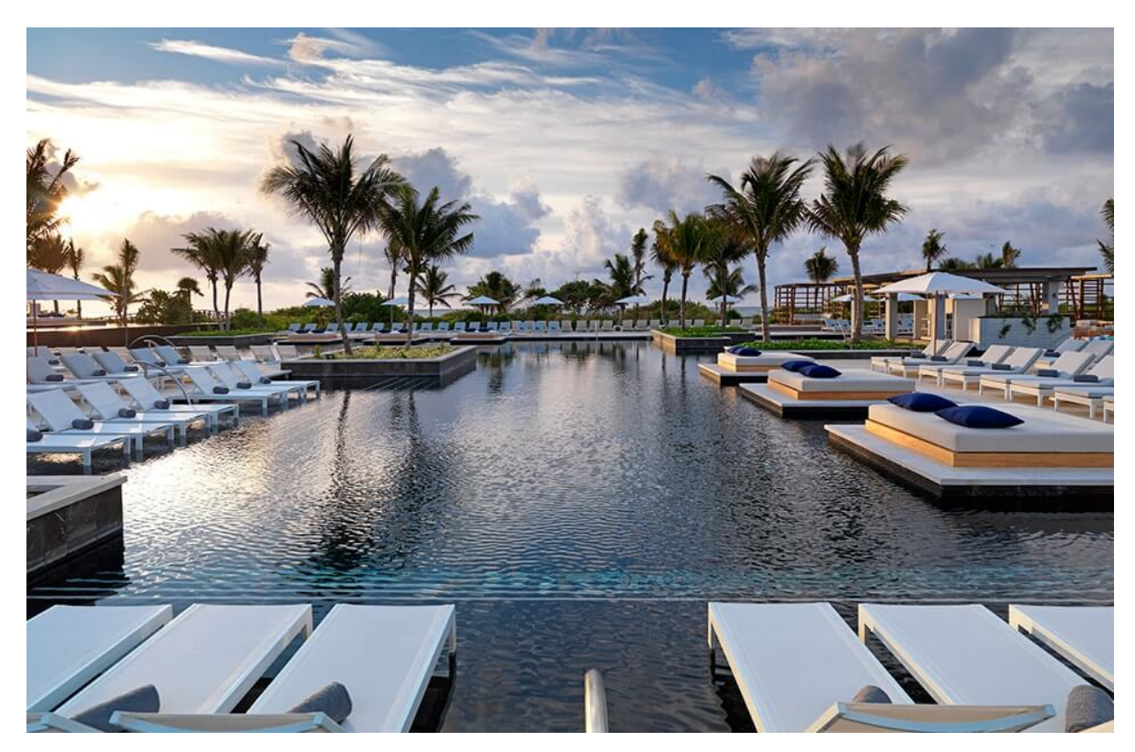
The Unico 2087, it's every bit as nice as it looks.

2. What to Do: There's three main things to do in Tulum. There's obviously more than that, but the first is to visit the old Mayan ruins. Now, normally I don't like tourist traps, but the Mayan Ruins are certainly worth seeing and so unique to this area of the world and so well preserved that they're definitely worth a visit. Just know that during the middle of the day there is ZERO shade and it gets guite hot. I would recommend using a tour guide from your hotel or a local service as they know the guickest routes in and out of the place to make the whole experience a bit more fulfilling. second thing you want to do in Tulum is just browse the actual town of Tulum. The main "row" is essentially a quaint one street town with a road and palm trees overhanging it. On both sides there's hotels, stores, and a ton of shopping. You could easily spend a few hours just perusing this area and going in and out of Many of the hotels here are worth visiting just for a few hours for a meal or for a day fee to use their "beach clubs". Of particular note worth visiting is