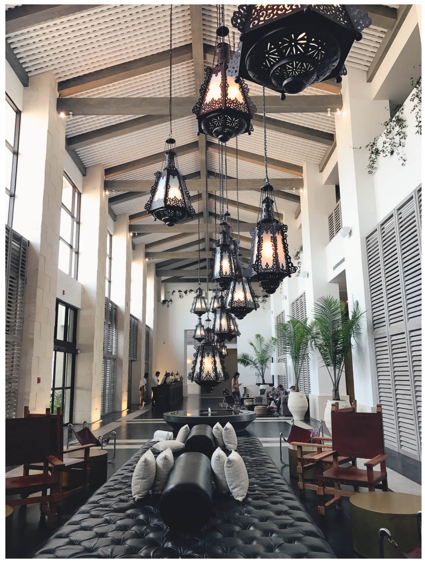
Luxury unveiled the minute you walk in