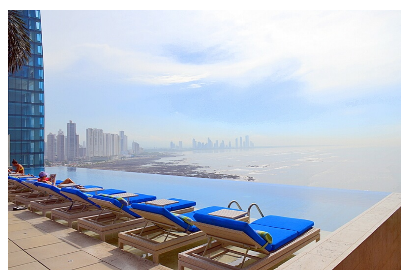
The pool may look stunning in the pictures but the view is of swampland and the building blocks most of the sun