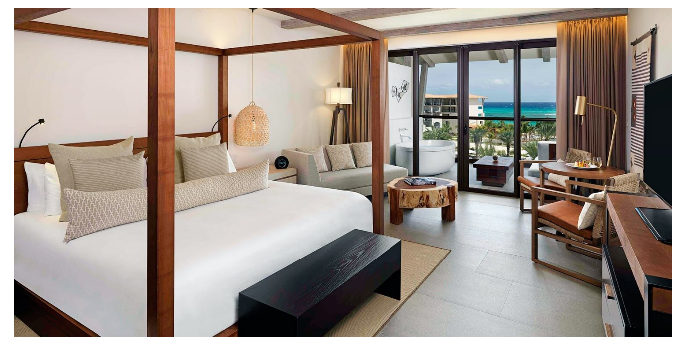
An absolute delight, comfortable and modern, these were some of the nicest rooms i've seen in the 5 star category

Now if you decide to leave the property (Which I highly encourage doing), they have an incredibly helpful concierge and booking service. Through them we got locals type tours of Cenote's (cave swimming holes), and of the local ruins of Tulum. Seeing as how the resort is ideally located Tulum is only 25 minutes away so this is sort of the perfect place to stay without being in the hustle of the city and being able to enjoy Resort life AND Tulum life.