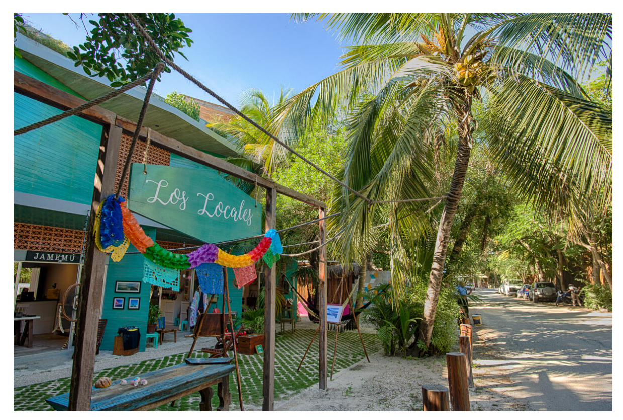
This is the main street. Stroll it.