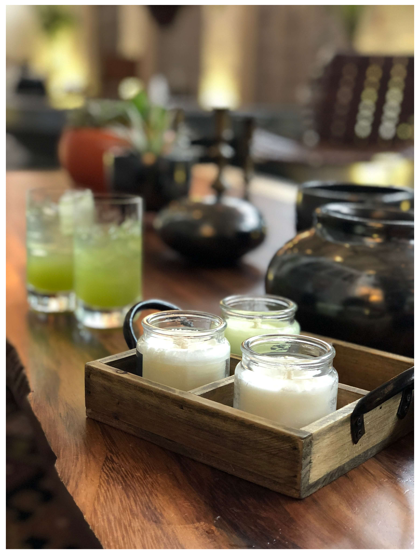
Welcome drinks + Relaxation Candles. This is how you welcome guests!

Now onto the property itself. This place is a VERY large.