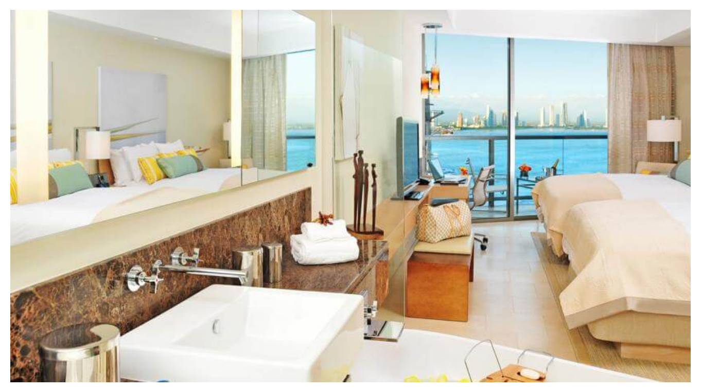
The rooms weren't terribly decorated but had odd space planning