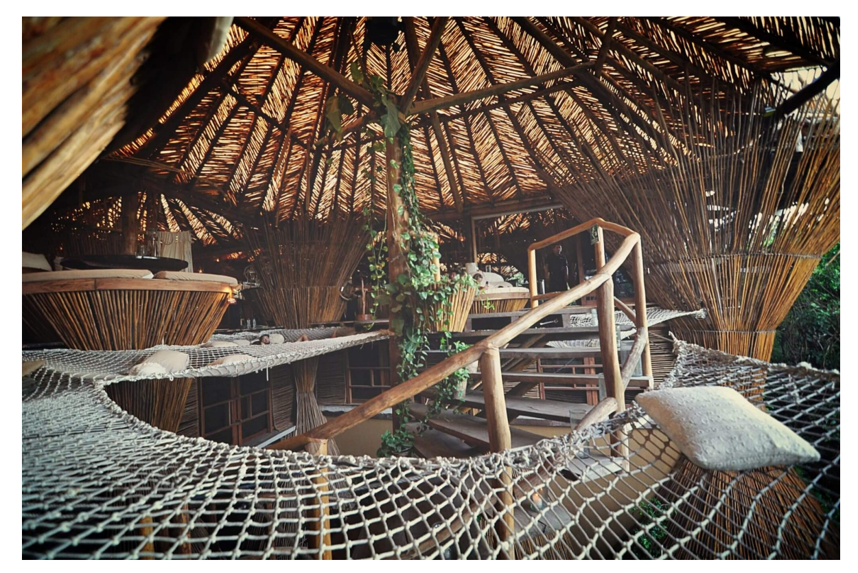
This is Kin Toh. You'll want to spend a lot of time here.