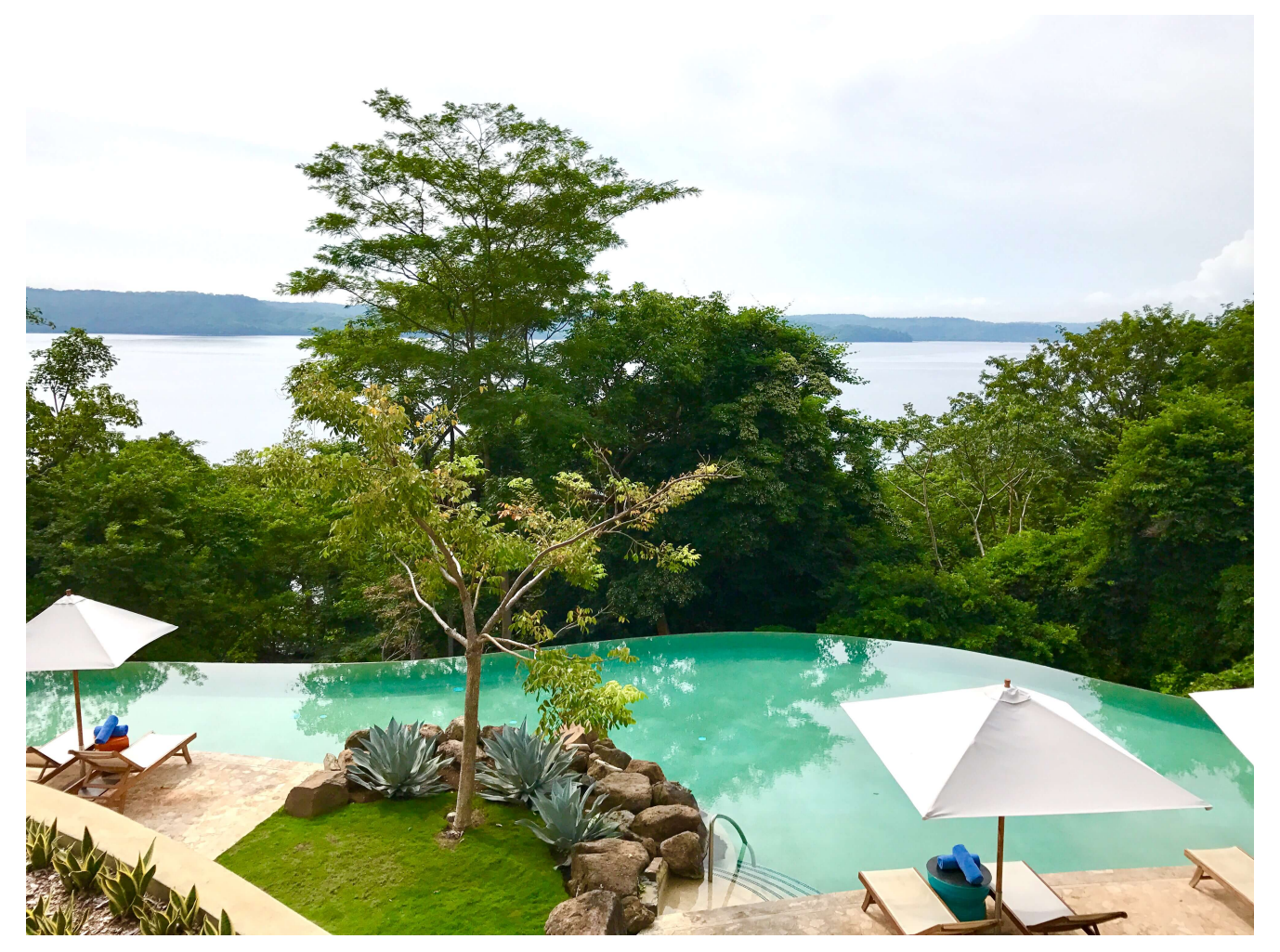
This is the view that you'll be seeing every morning as you have an amazing breakfast

One of the first things you'll notice when you enter the Papagayo Peninsula and then the Andaz is just how secluded it all is. Costa Rica, in general is already a getaway, but at the Andaz the buildings just meld into their environment making guests feel at one with the nature around them. When I was choosing whether to stay at this hotel, or the Four-Seasons down the street I decided upon the Andaz due to its newer build and more zen-like atmosphere. I did get a chance to visit the Four Seasons one night and my decision, in retrospect, was correct.