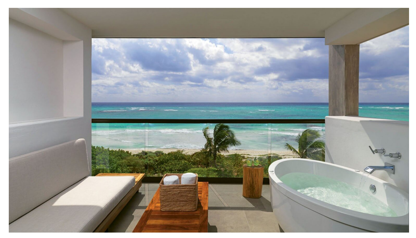
Don't want a plunge pool room and prefer a hottub with a view? They have that too

Don't want a hottub? Then choose a room with direct access to a plunge pool