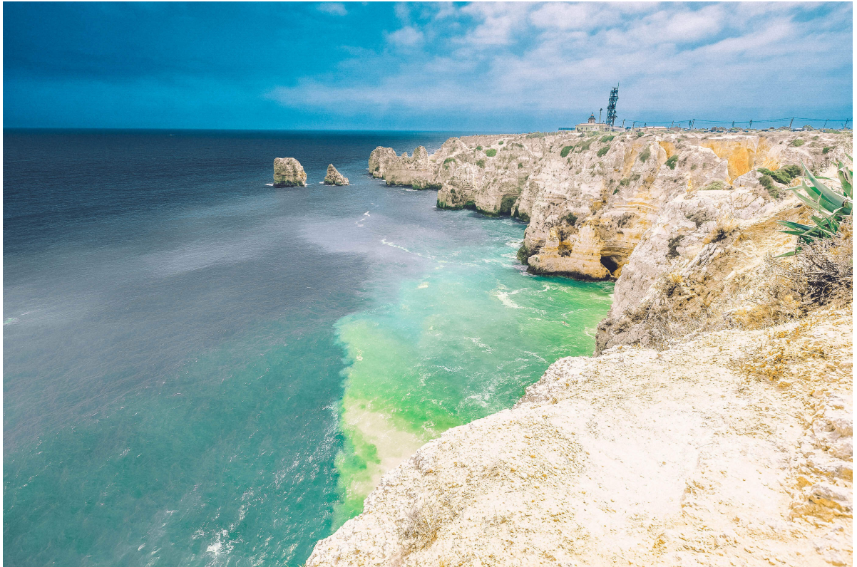
The Lagos Coastline and its incredible bluffs