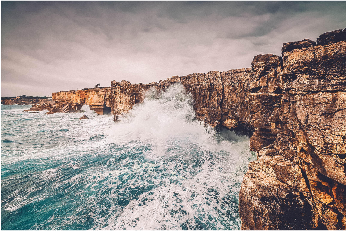
Boca Do Inferno in Caiscais