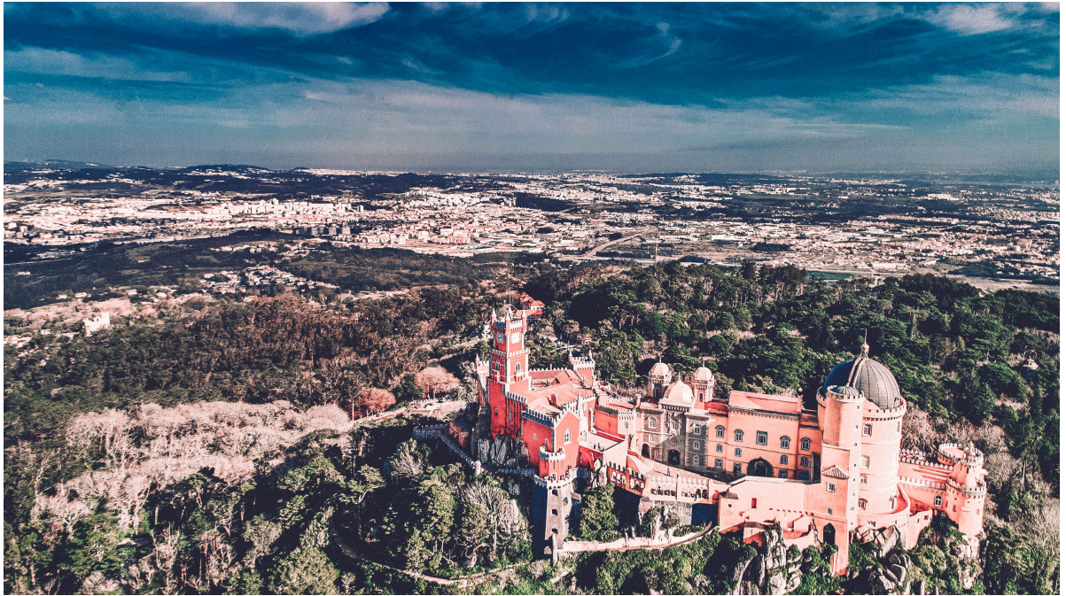
Palacio De Pena in Caiscais