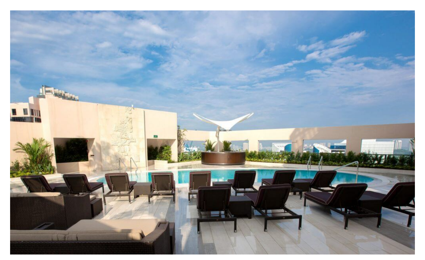
The views from up here are pretty spectacular

The rooms themselves are large and luxuriously appointed, and as per usual, the bed was incredibly comfortable. The colors and decor are nothing that will blow your socks away, but what the rooms lack in singleness they make up for in luxuriousness.