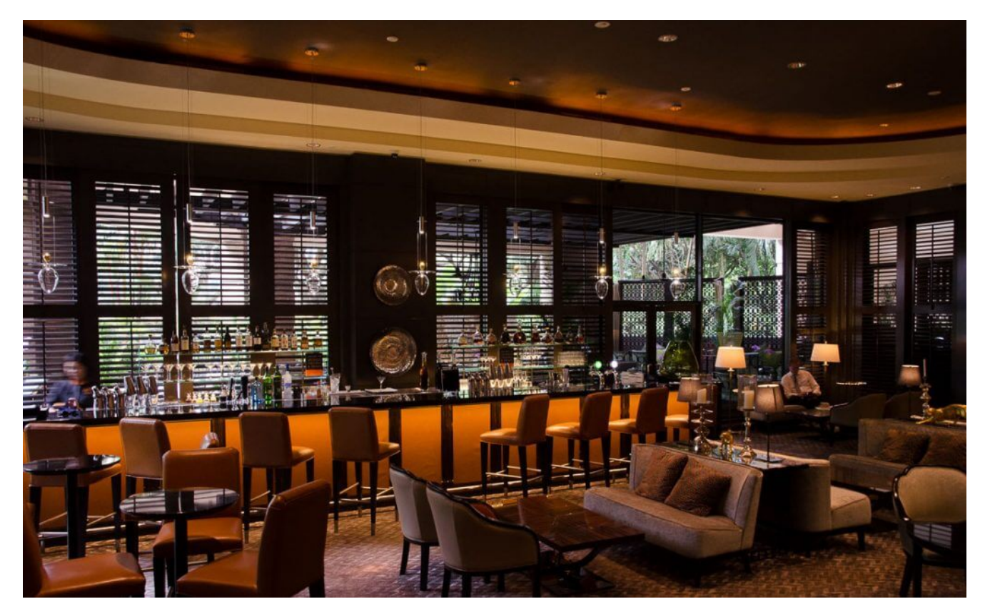
The lobby bar was a cozy and swanky affair

I would recommend spending some time in the lobby bar, because that is probably my second favorite space in this property