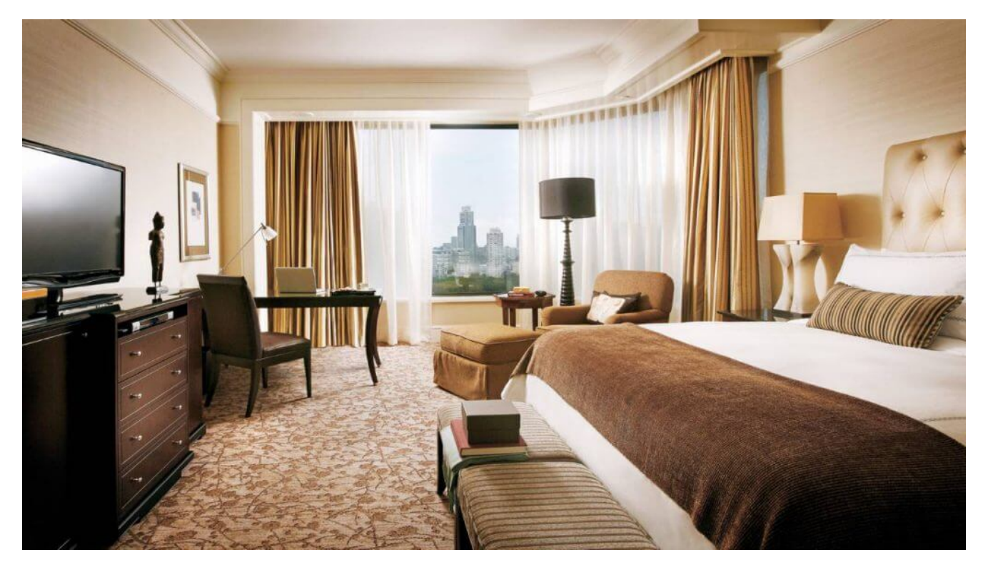
The Rooms — It's not the most modern of designs, but it sure is luxurious