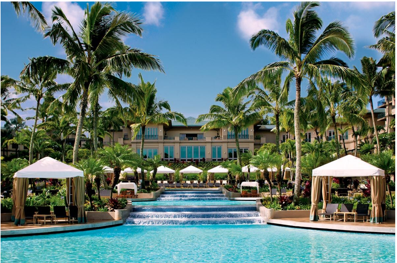
The stock photo

The island of Maui is not necessarily my favorite because of a variety of reasons. Most of those revolve around my theory that it's the neglected "child" of an island. It doesn't share as much greenery as Kauai, certain portions of the Big Island, or even the windward side of Oahu. It also doesn't have the culinary faire or the cultural sights of Oahu or the Big Island, but mostly, it's just large and barren.