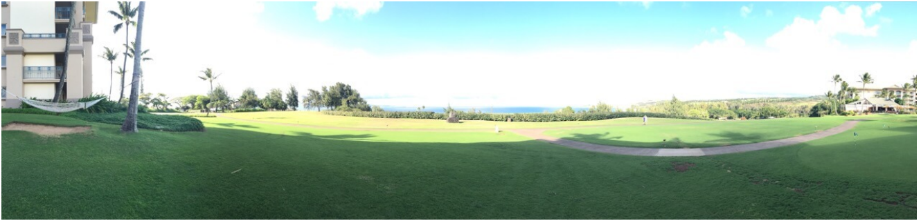
A panorama of the grounds