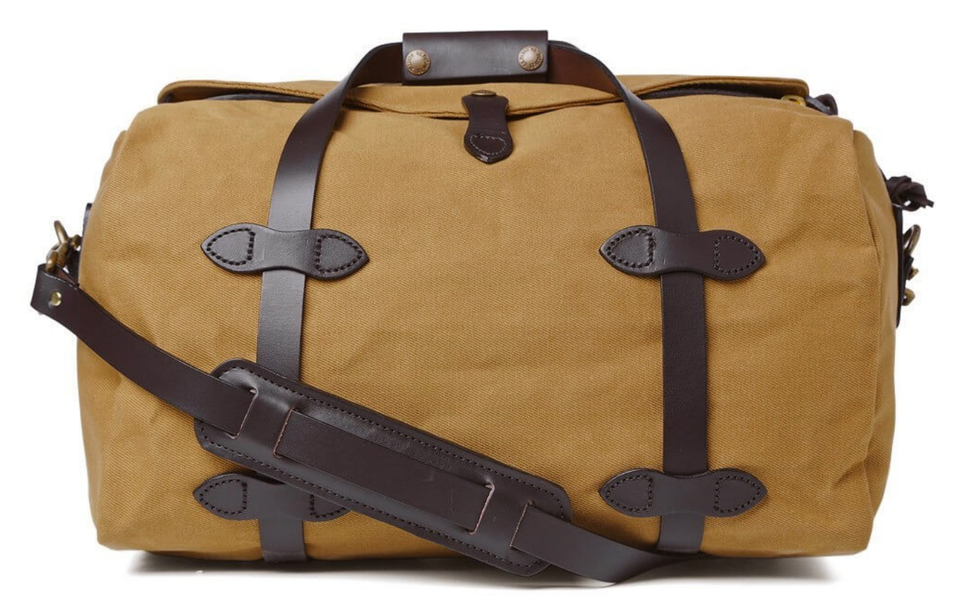
Damn near indestructible, and damn pretty