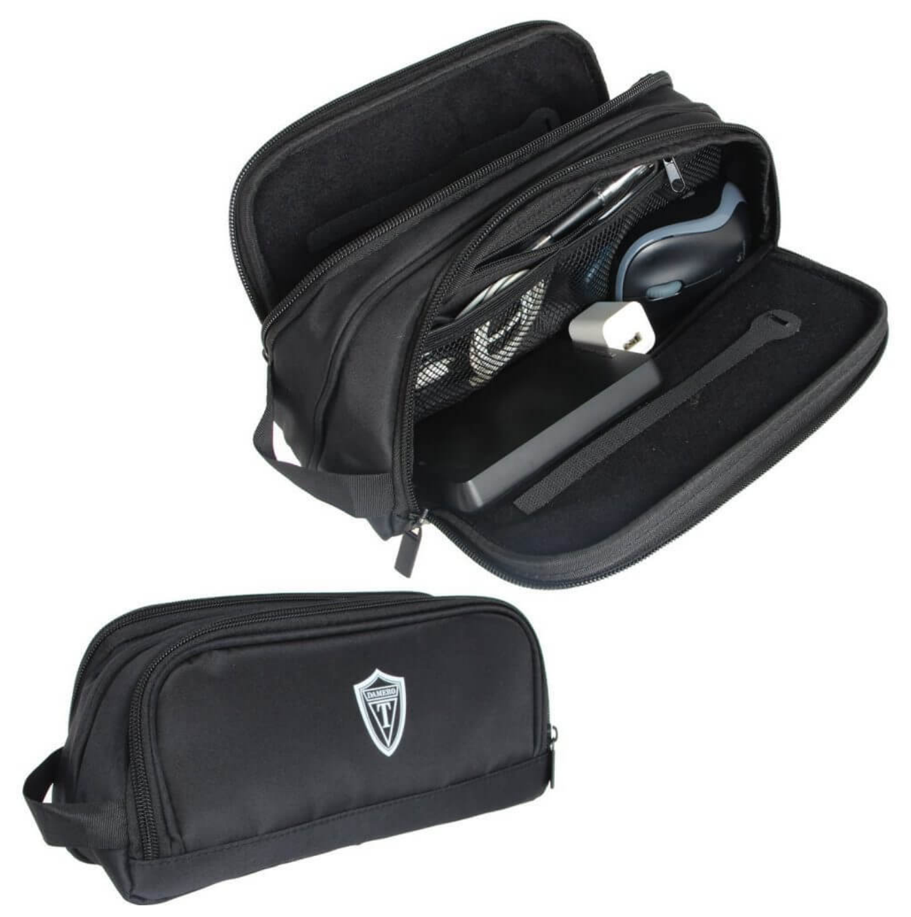
They're perfect for putting in anything small and delicate

go. They are also padded, so you don't get the odd crushed charger prong or broken iphone. They're cheap and can be purchased here