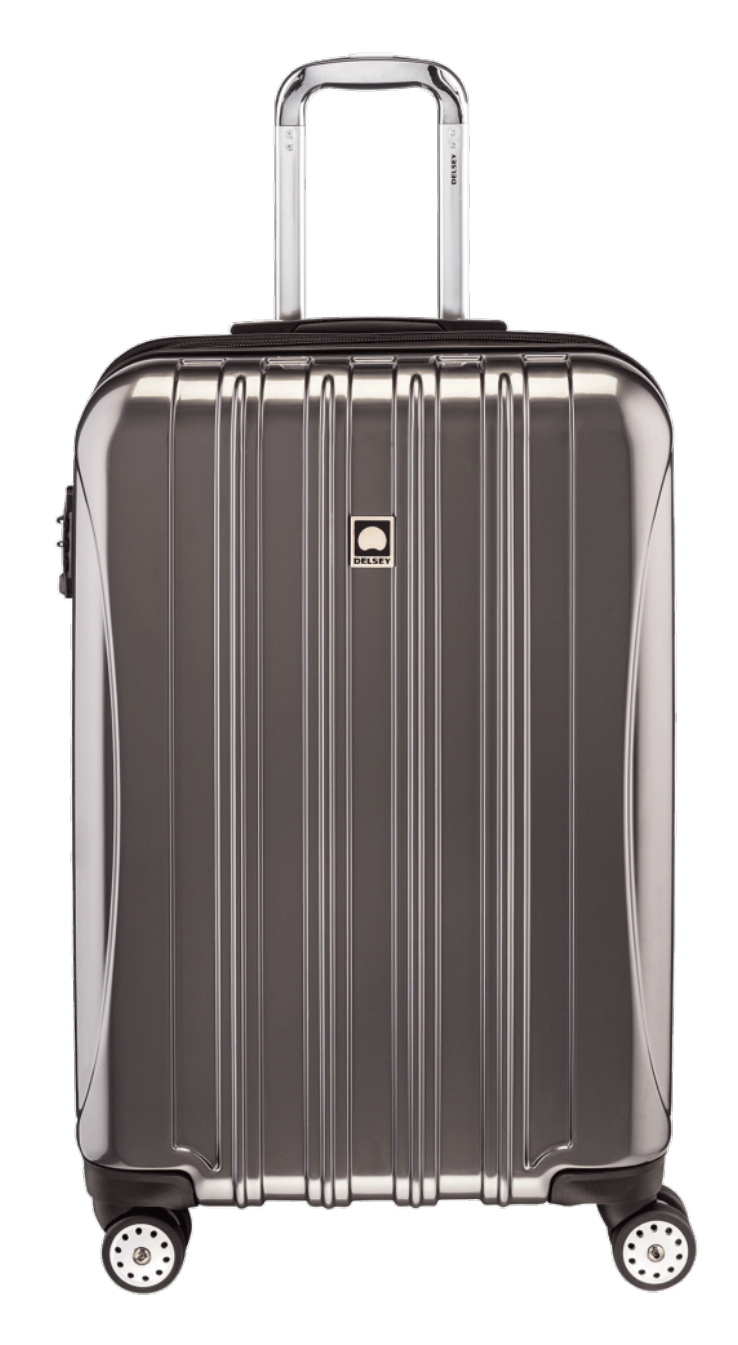
Simple, cheap, and awesome