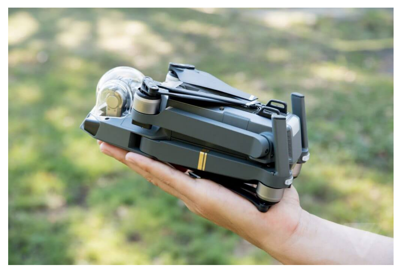
Its a bird, its a plane, NOPE — it's a Mavic Pro!

feature. I can't state enough how this tool will make your vacations way more fun as you create memorable footage and photographs from the sky and get a completely new vantage point of the world around you.