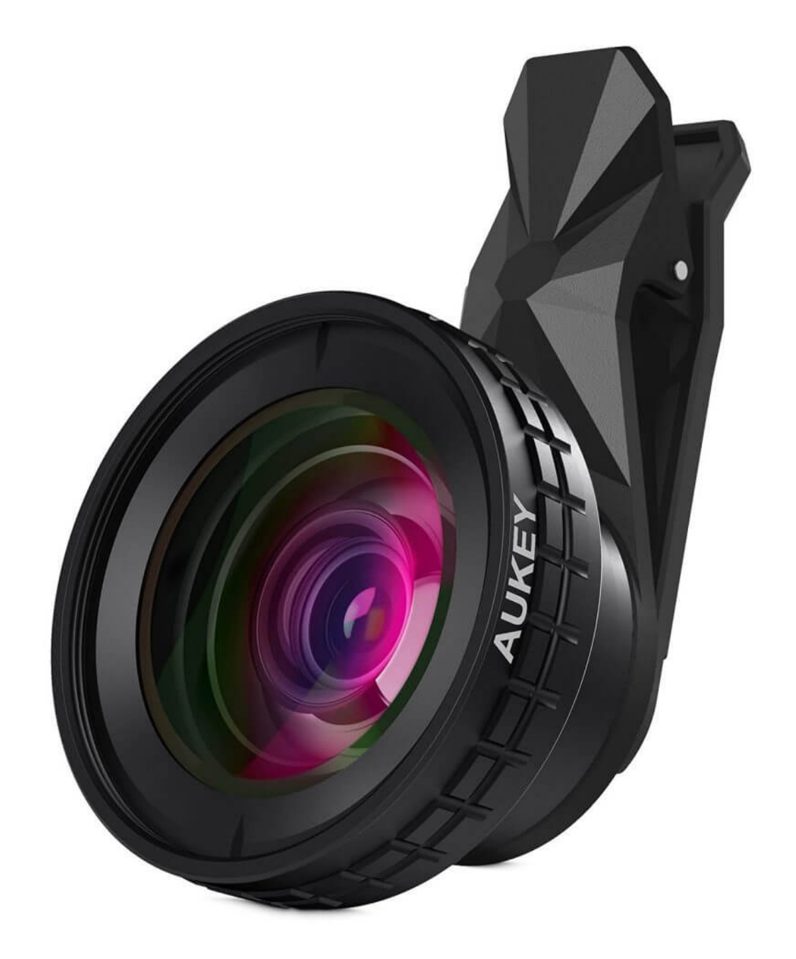
It'll do wonders for your smartphone