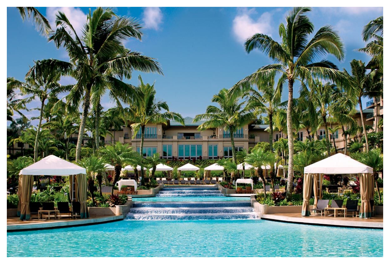
The stock photo

The island of Maui is not necessarily my favorite because of a variety of reasons. Most of those revolve around my theory that it's the neglected "child" of an island. It doesn't share as much greenery as Kauai, certain portions of the Big Island, or even the windward side of Oahu. It also doesn't have the culinary faire or the cultural sights of Oahu or the Big Island, but mostly, it's just large and barren.