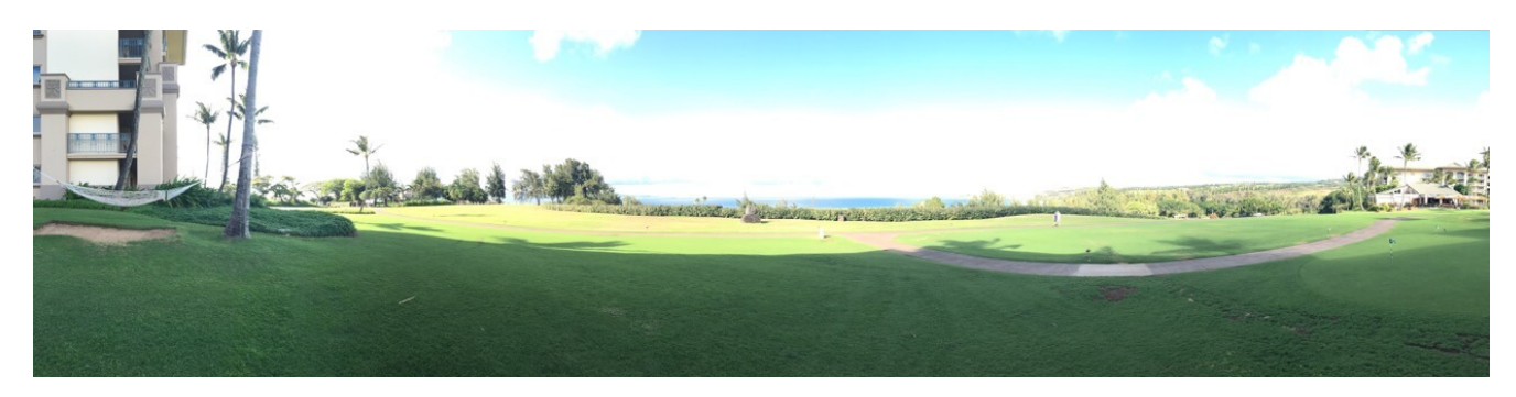
A panorama of the grounds