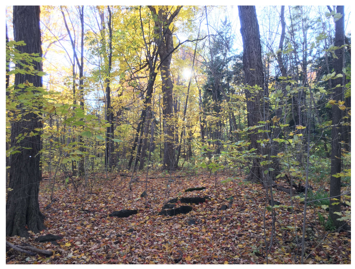
The random forest you have to hike through to get to the top of Mount Royal

The rewarding view from the top of Mount Royal