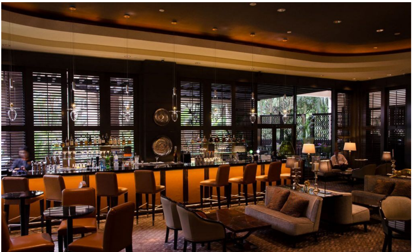
The lobby bar was a cozy and swanky affair

I would recommend spending some time in the lobby bar, because that is probably my second favorite space in this property