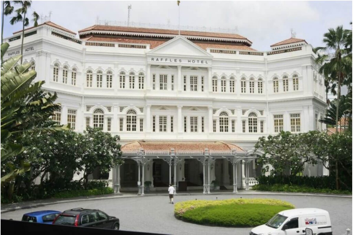
The Colonially Famous Raffles Hotel

redeeming value, and overly priced at that.