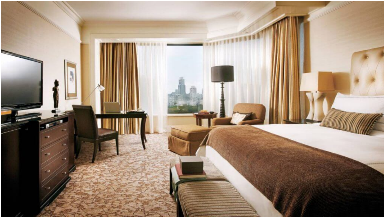
The Rooms – It's not the most modern of designs, but it sure is luxurious