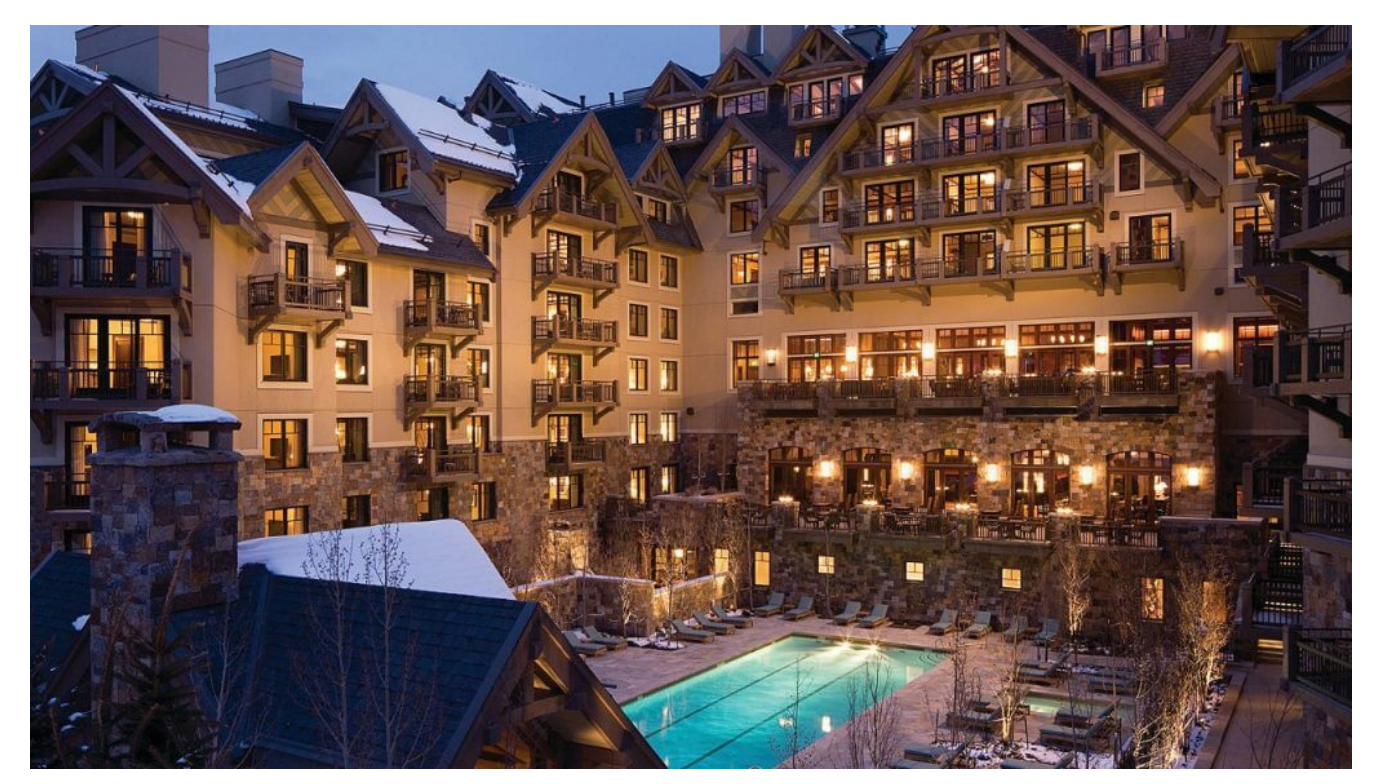
It's a beauty

This property seems a little newer than the Four Seasons I recently visited in Whistler, and it's a stunning showcase of wood & stone, fitting in perfectly with the Tyrolean village of Vail.