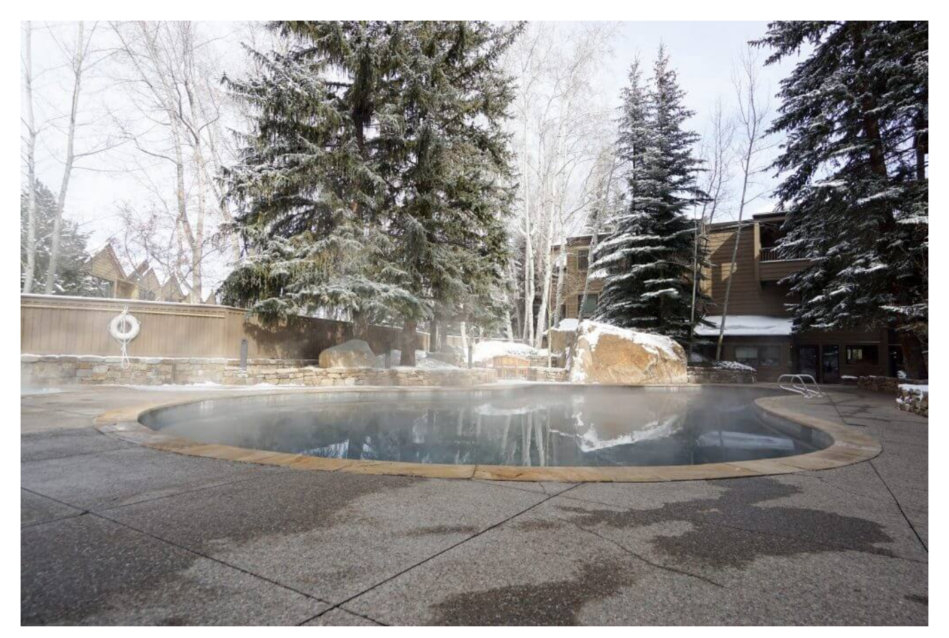
Need to unwind in the heated pool or sauna? They've got that too!

There's a few qualities which I especially loved about this property. One, the service was impeccable. Everyone who worked there knew you by name, things were delivered in a timely manner when requested, and of course there was the ever omnipresent Gant shuttles. You see, Aspen is a decent sized town, and sometimes when it's 5 degrees out you really don't want to walk too far. The Gant Shuttles run from morning until 11PM and they will pick you up from anywhere in town and will even take you to the airport. More surprisingly, I never had to wait more than five minutes at any point for a shuttle. This was by far one of the most impressive features of the property.