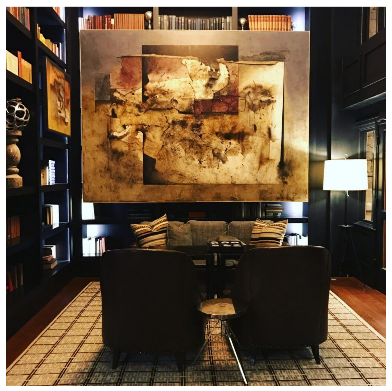
Yes, all the artwork is real. And real pretty.

The hotel has a boutique feel to it, in the sense that everyone knows your name, and that nothing feels corporate about the property. The foyer housing the restaurant Leonara is a gorgeous setting, with staircases winding up and down the three terrace room as if you were in a real life version of Escher's stairs.