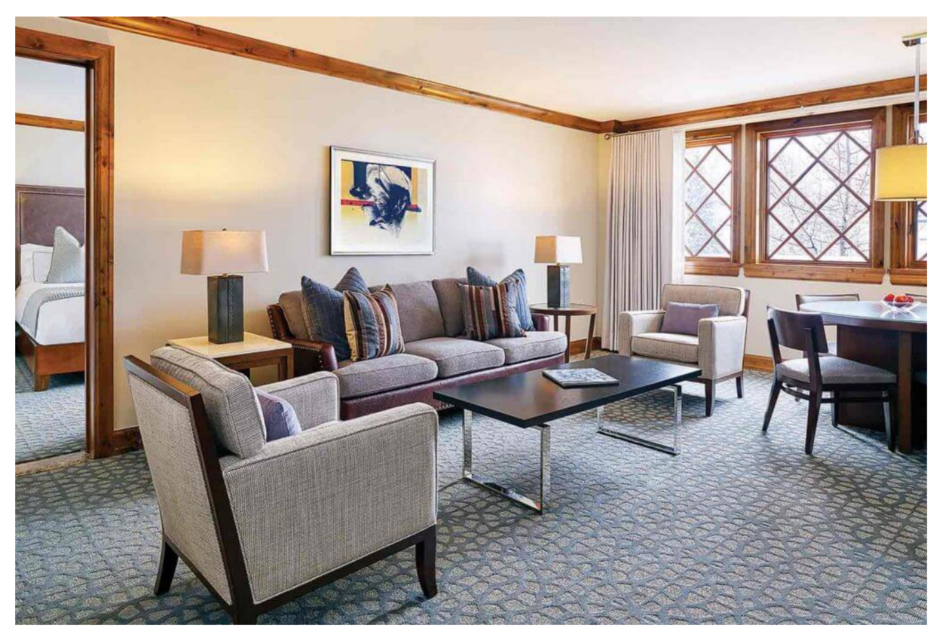
Beautiful decor makes you feel right at home

The rooms themselves are also beautifully decorated, immaculately kept, and barely show their 7 year age.