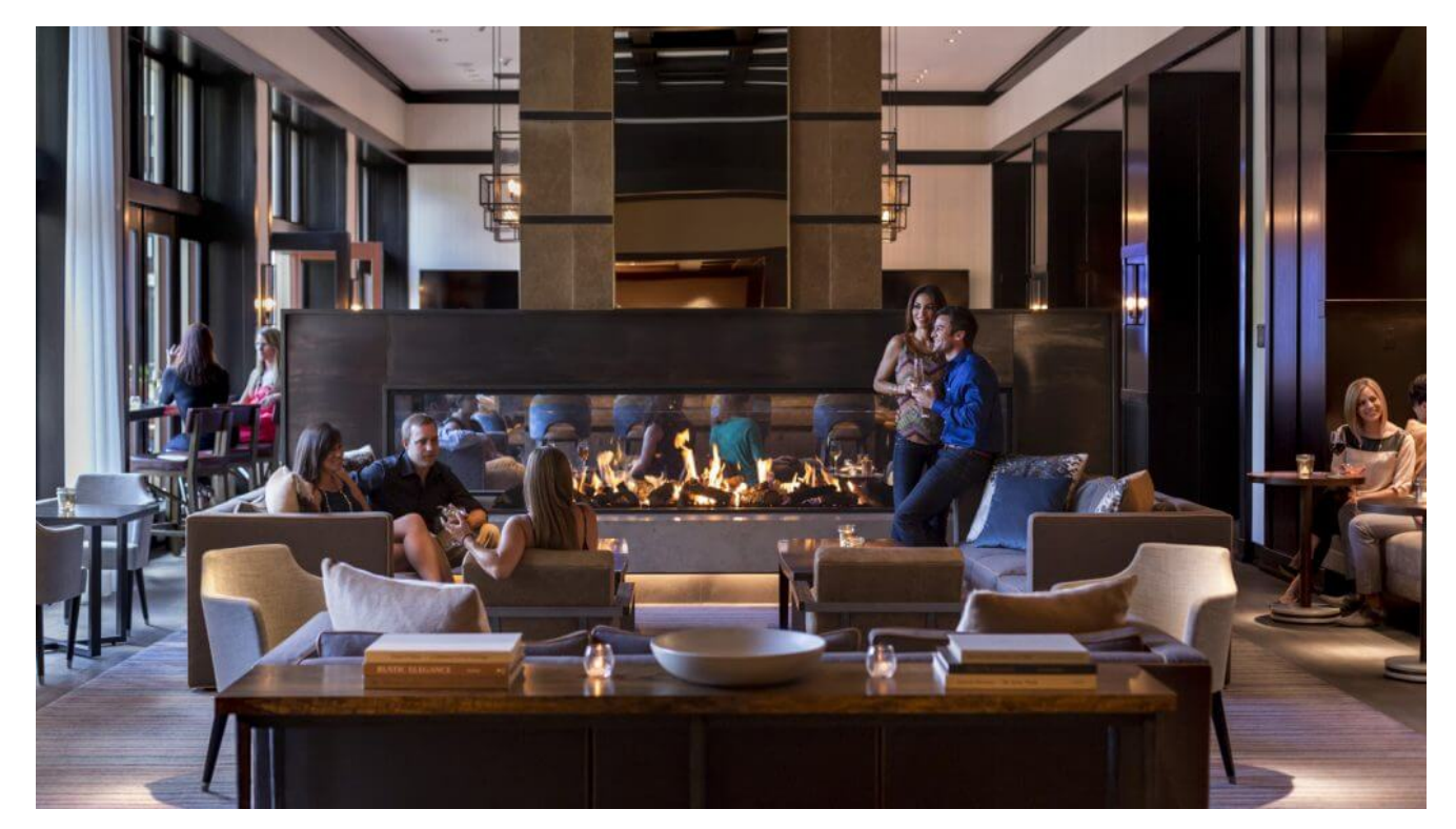
Fancy an Apres Skiing moment? Four Seasons is happy to help

The rooms are understated and elegant, with attention to detail in the soft product — clothes folded for you by maid service, turn down service with night time snacks. After staying in hundreds of luxury properties some of these things can seem repetitive (and I write that without any flippancy), but the Four Seasons always amazes me by the consistency of their service and this Vail property doesn't stray from that.