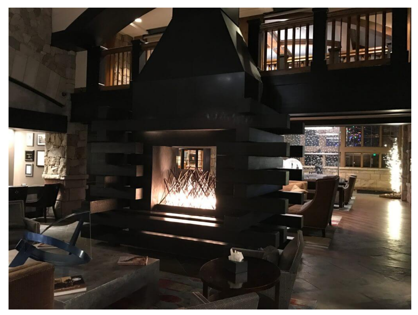
The lobby..yes its cozy

The minute you walk into the property you notice how well built everything is. There's a solidity to everything about this hotel, from the extreme insulation in between the floors and rooms, to the stunning timeless decor, and the multimillion dollar artwork, the property screams class and elegance.