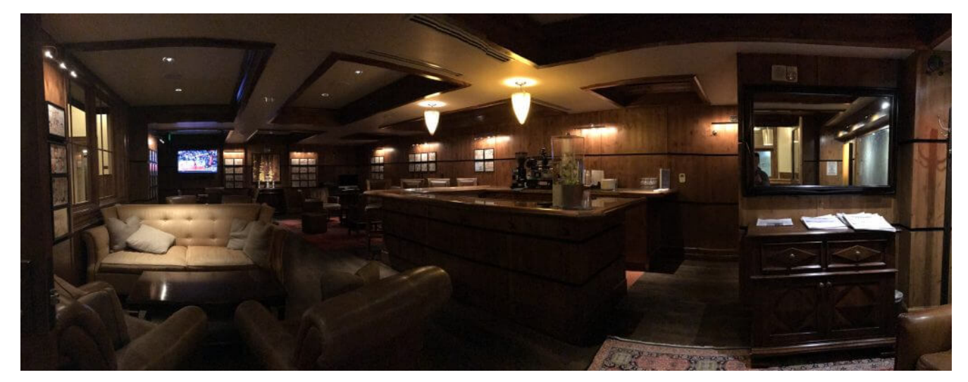
It's a dimly lit picture, but this is the owner's lounge, a quaint dark room with leather bound books and tons of mahogany

for everyone to lounge and relax in really is what sets this mountainside resort apart from the competition.