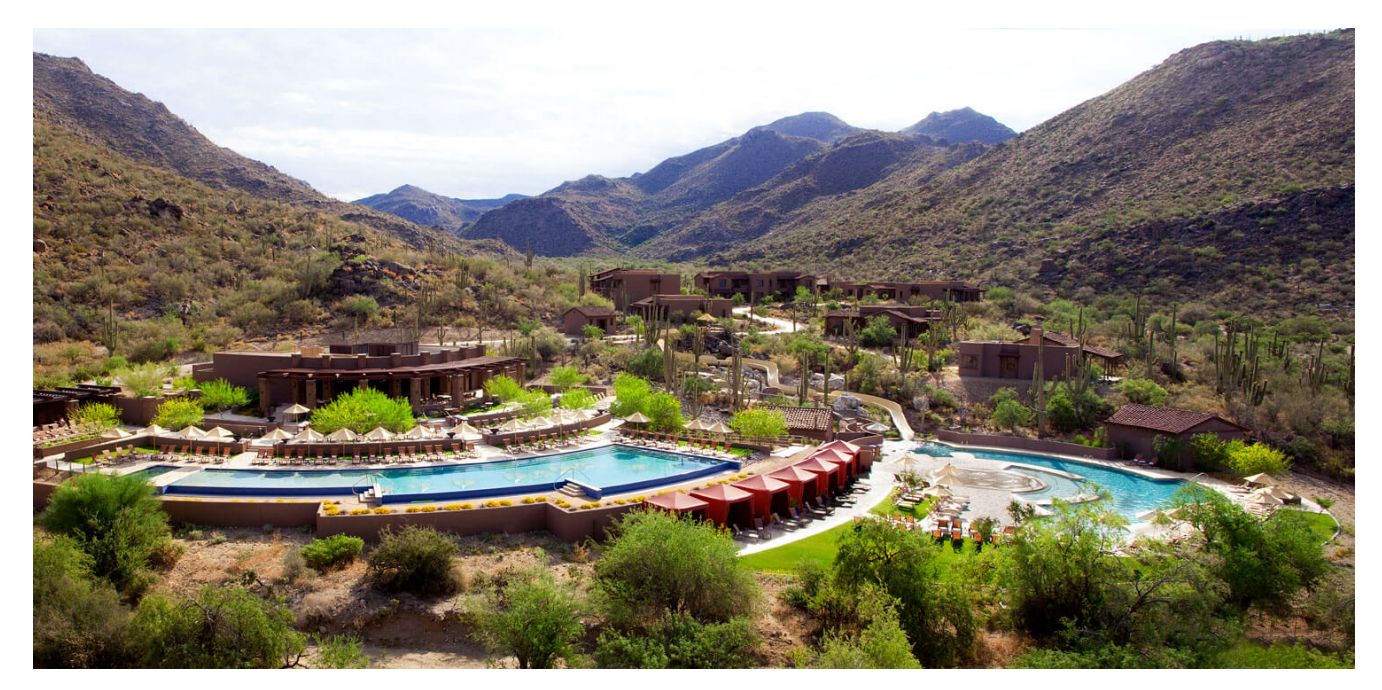
Check out that waterslide!

There's multiple decks, amazing views of the landscape around the hotel, and even a waterslide — if you feel so inclined.