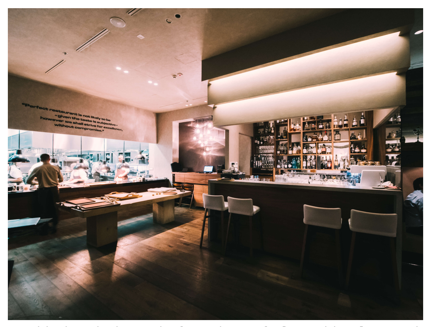
Open kitchen design made for a homey feel to this place. The cuisine was incredible as well!

One of my favorite aspects of this hotel was the bar and restaurant located in the lobby. Costes Downtown is a one michelin star spot, one of the best in Budapest, and not only did they serve breakfast, lunch, and dinner, but they also had a mixologist on staff during all restaurant hours. The environment was cozy, relaxing, and fun.