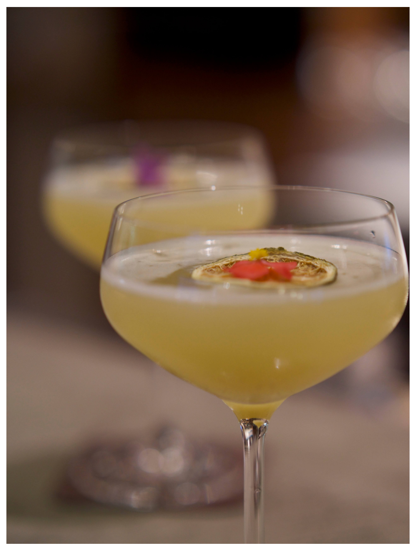
Phenomenal drinks at the bar in the Hotel Prestige

Overall, there are certainly larger hotels with a greater multitude of facilities, but if you're looking for new modern