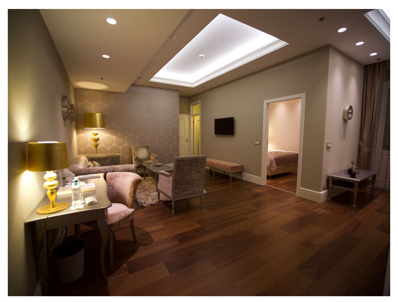
Beautifully appointed suites at the hotel prestige make for an incredibly comfortable stay

ceilings, beautiful wood floors that added to their warmth, and great sound insulation and modern showers and bathrooms. Visiting Budapest near the end of Fall was a colder experience than normal and being at the Prestige Hotel really added to the trip as whenever I got back into my room I just wanted to relax and be coddled.