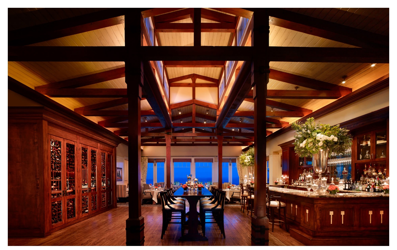
My favorite part of the Montage is the restaurant there — The Studio

Monarch Beach. They feel like they have a bit more soul and offer something slightly different than the standard large beachside resort. That being said, you really can't go wrong with any one of these hotels.