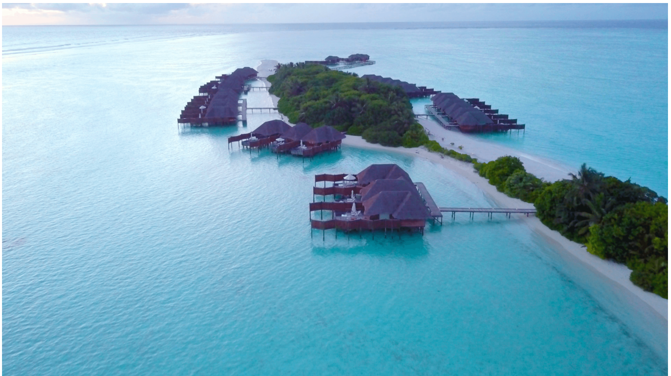
The smaller of the two islands at the Conrad Maldives

After my entire experience at Rangali, I can wholeheartedly recommend a visit. With just a few things lacking, such as the cuisine at a couple of the restaurants, there isn't much to spoil a vacation in paradise. Between the stunning views, secluded beaches, incredibly attentive service, and white glove treatment from arrival to departure – a visit to Conrad Rangali will leave you in smiles wanting to visit again!