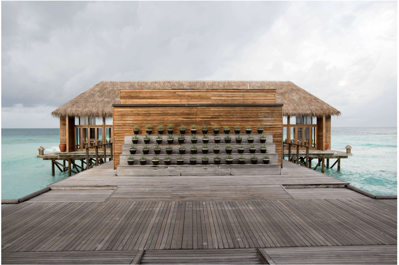
Beautiful architecture at the spa restaurant

Another incredibly unique feature at this hotel is the undersea restaurant. There's only one other Maldives resort that has something similar, and it is the Hurawalhi (also a nice resort but much smaller). Although a few of the restaurants at this hotel are not part of the "all-inclusive" resort price, they are worth spending the money to discover because the experience is so unique. I had the chance to eat at each of the restaurants and the inclusive buffet, and I must say that the cuisine at a few of the restaurants was particularly exquisite, while a few experiences did lack in food quality. This is something that apparently is under constant change so your experience may differ once you visit Rangali. My recommendation is to try the Tepan-Yaki experience at Koko Grill, and the Chinese dining experience at UFAA. Both of those were top notch and I would gladly pay to eat at either again.