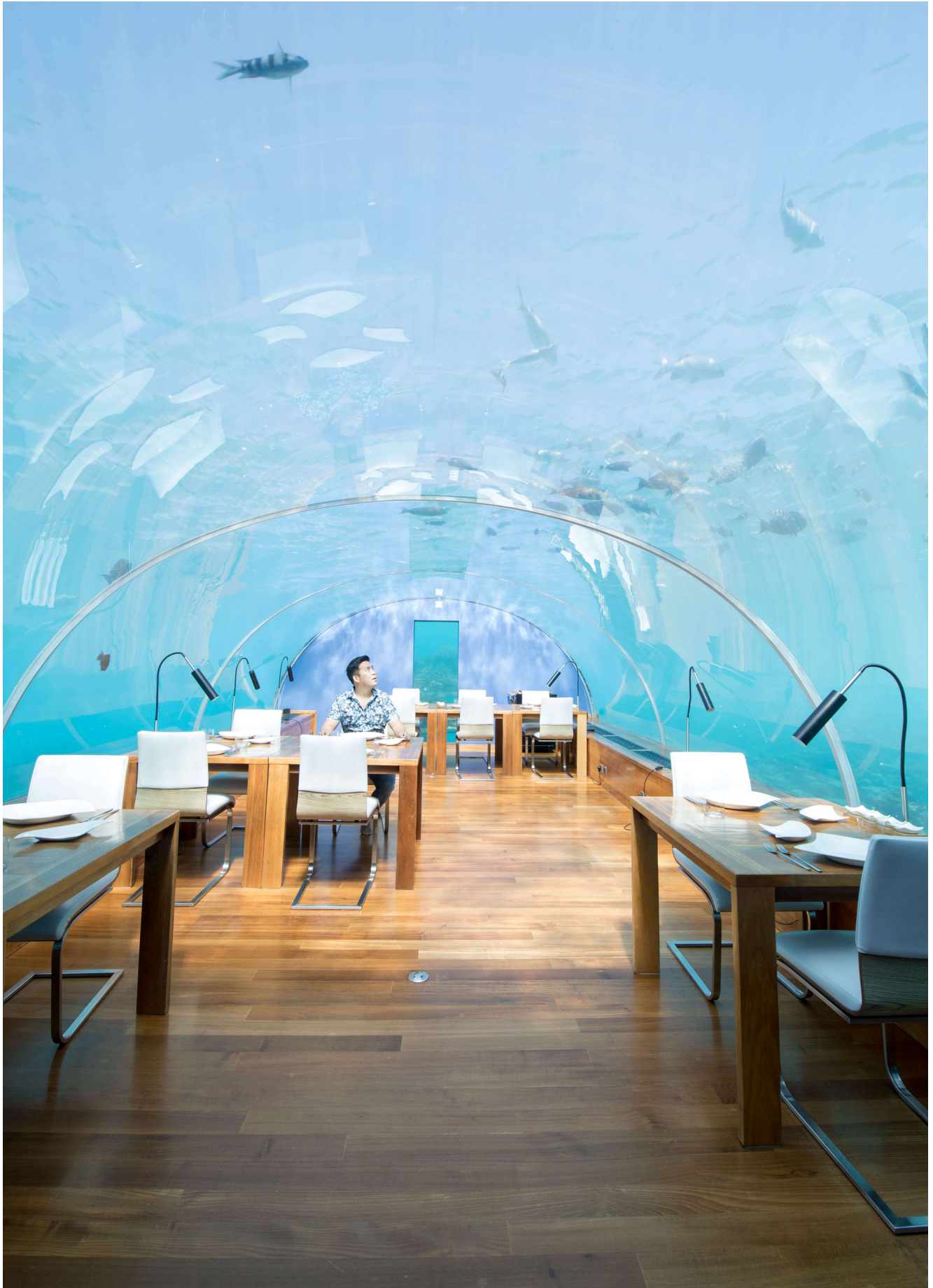
The Underwater Restaurant is built right into the coral reef and worth visiting for cocktails