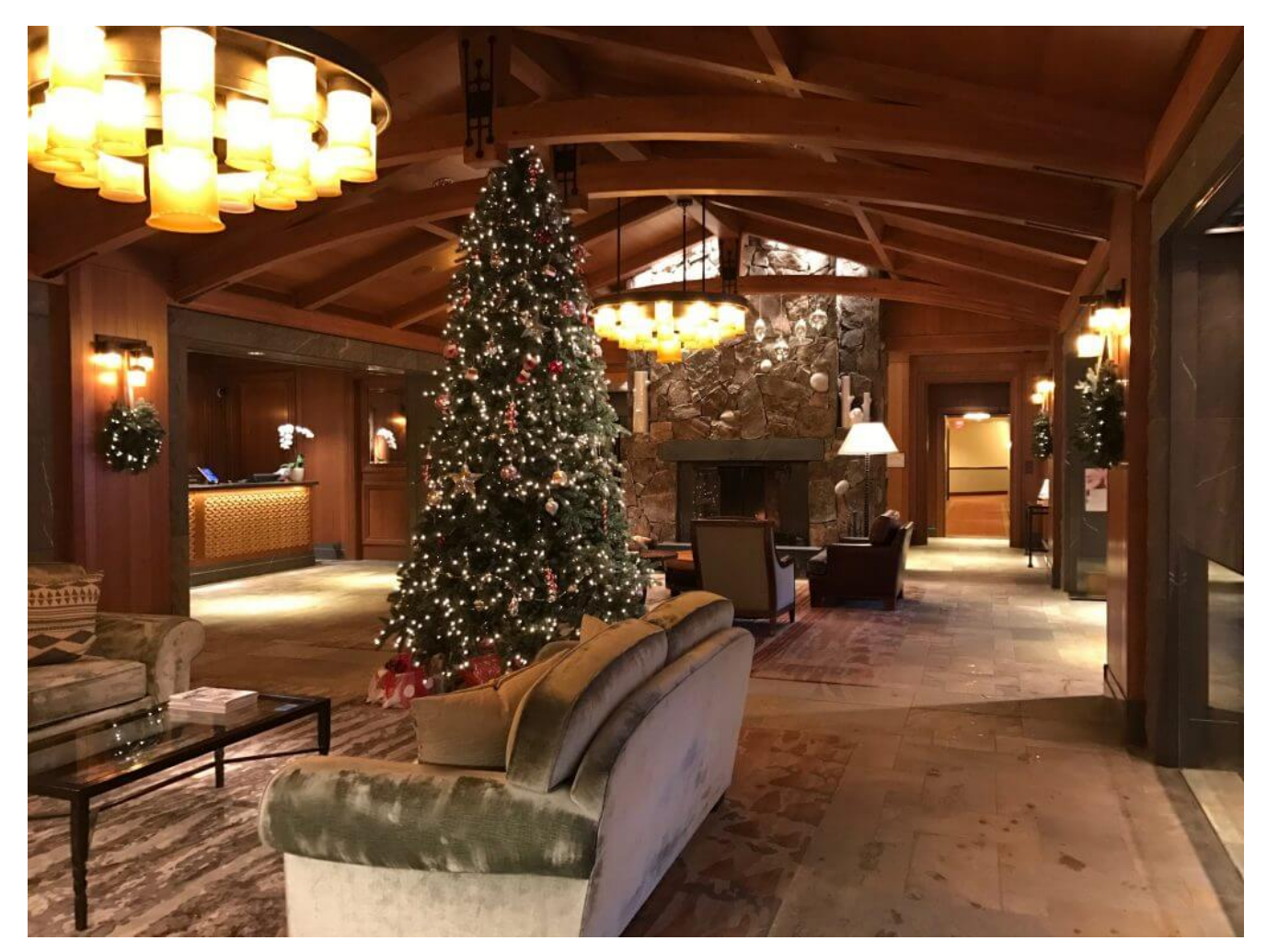
The main lobby. Christmas decorations really jazzing it up

There's a lot to love about this hotel, the ski concierge service which makes renting equipment a breeze. You go downstairs, get fitted, and the next morning your equipment is ready to go twenty feet from the base gondola. The restaurants were both delicious and priced relatively affordably for a five star property. The staff were attentive and knowledgable, and the outdoor pool and jacuzzi were an incredible reprieve at the end of a long day down the mountain.