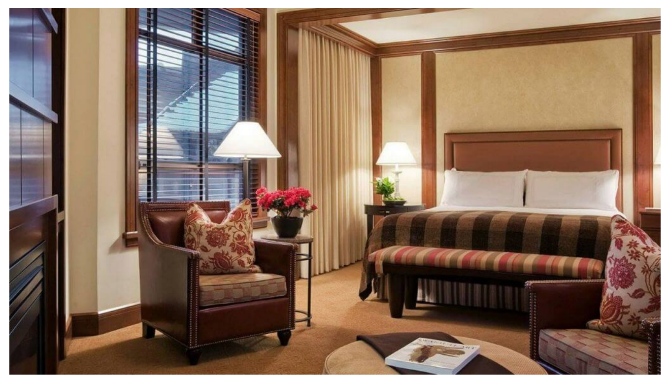
The rooms are a bit old school.

There are certainly a lot of choices in this town, especially since it had its Olympic debut a few years back, but the Four Seasons is at the top of my list and will remain there. If you are looking for other choices, however, I would recommend looking into the Sundial Boutique and the Fairmont Chateau. Both properties are a little older than the Four Seasons, but offer similar accommodations with slightly less amenities, but at a slightly lower price.