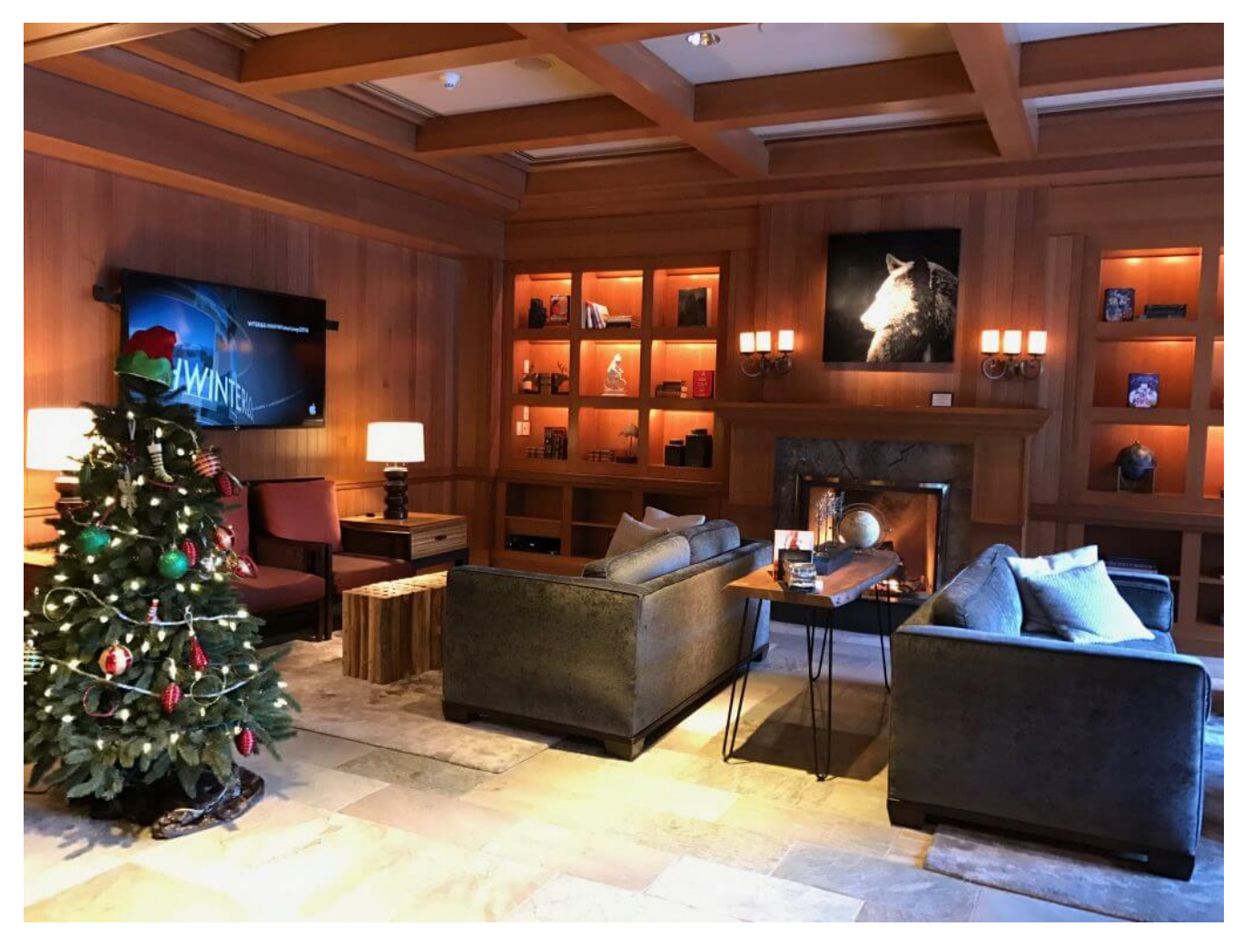
That's the living room. I spent a lot of time here