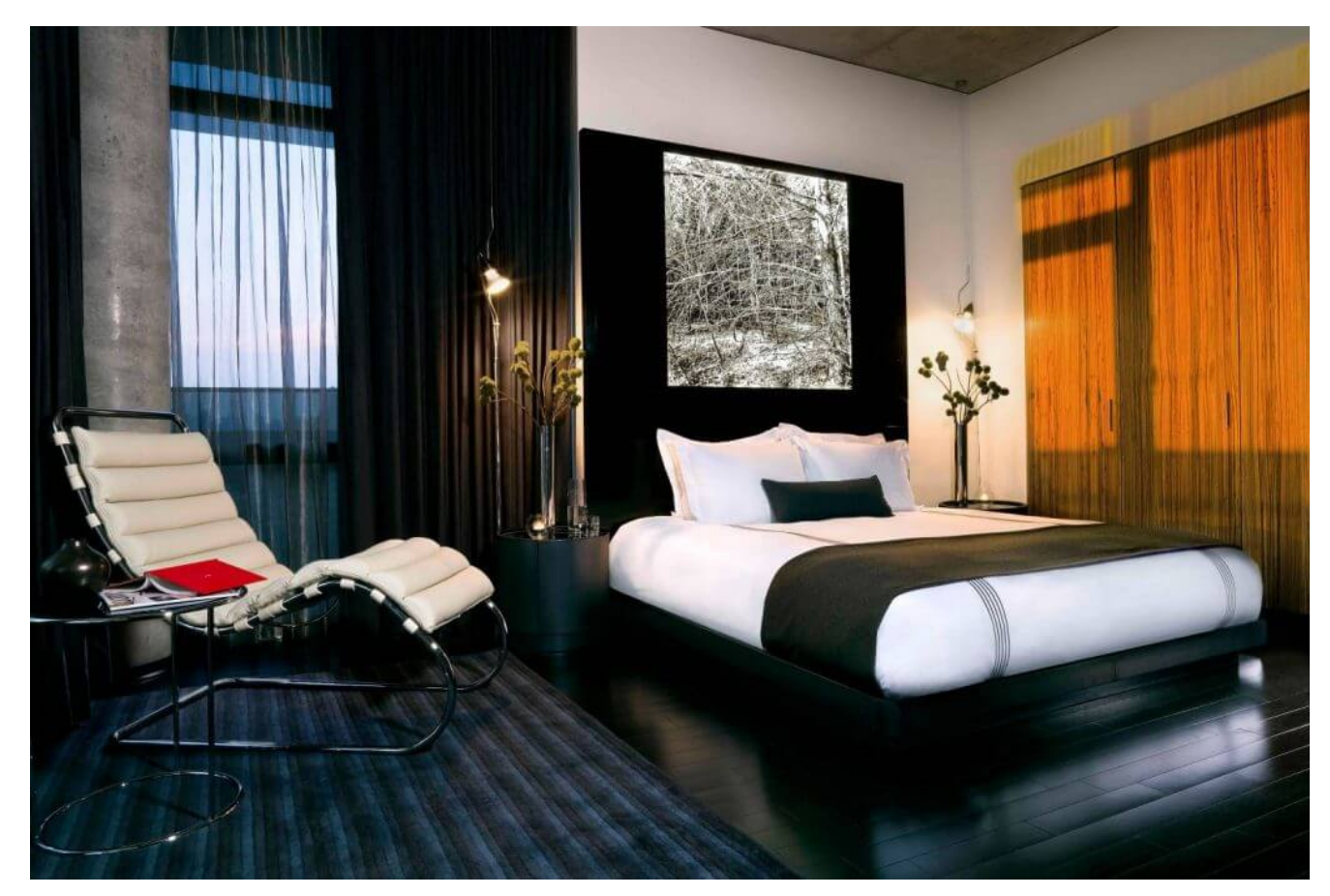
You can't help but feel hip in these rooms