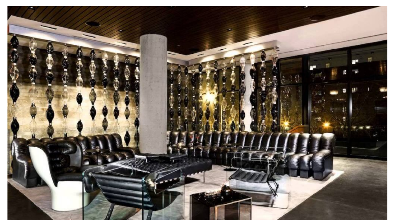
The lobby seating area captures the essence of the hotel perfectly. A juxtaposition of concrete, leather, and faux fur

The rooms are bare concrete, and some might argue that it feels a bit cold, but here in lower manhattan, it just feels right. The lightboxes above the beds feature the work of Lee-Friedlander, and the bathrooms are just plain cool looking.