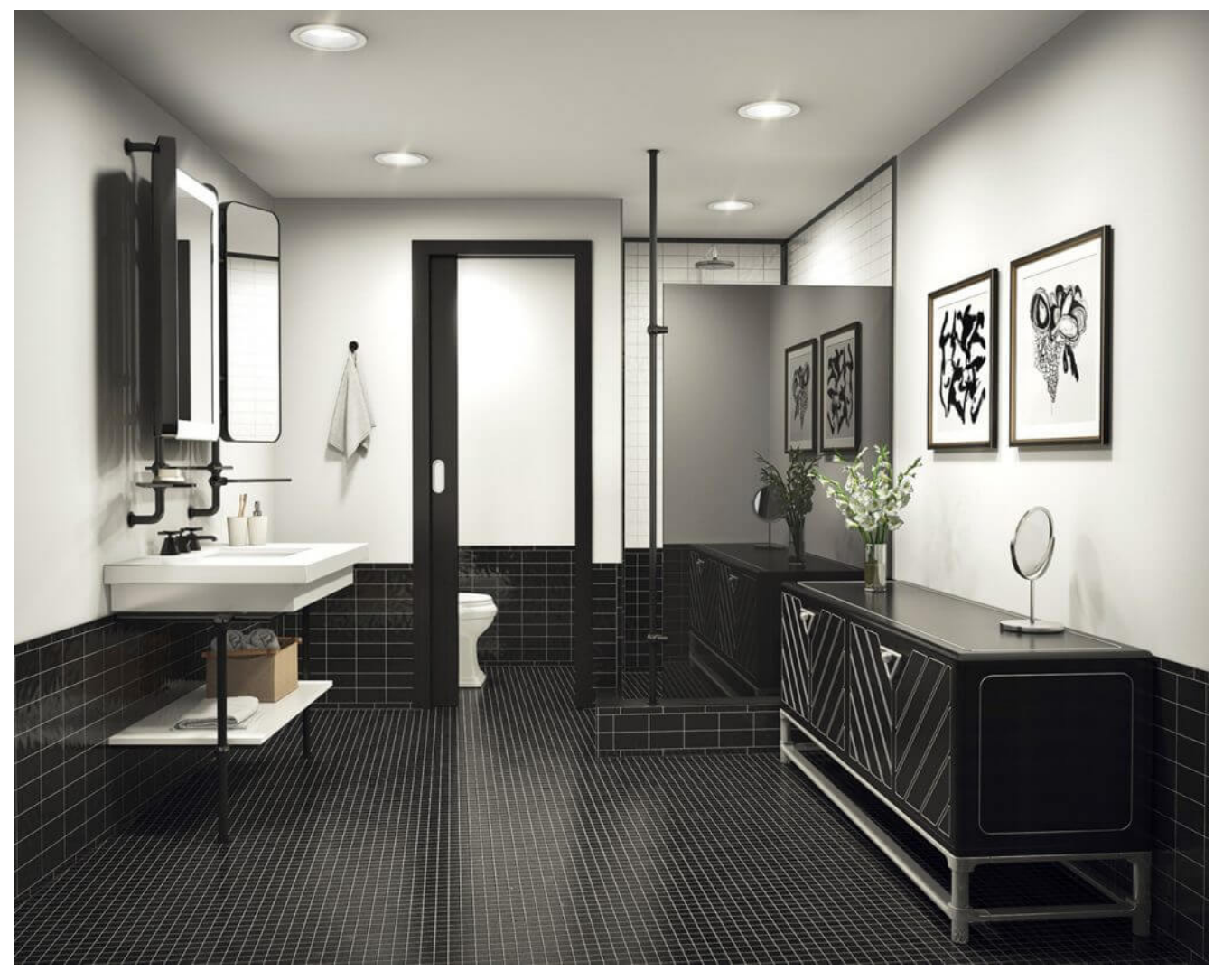
It's a nice bathroom, but a bit \operatorname{cold} — especially in a city like Seattle