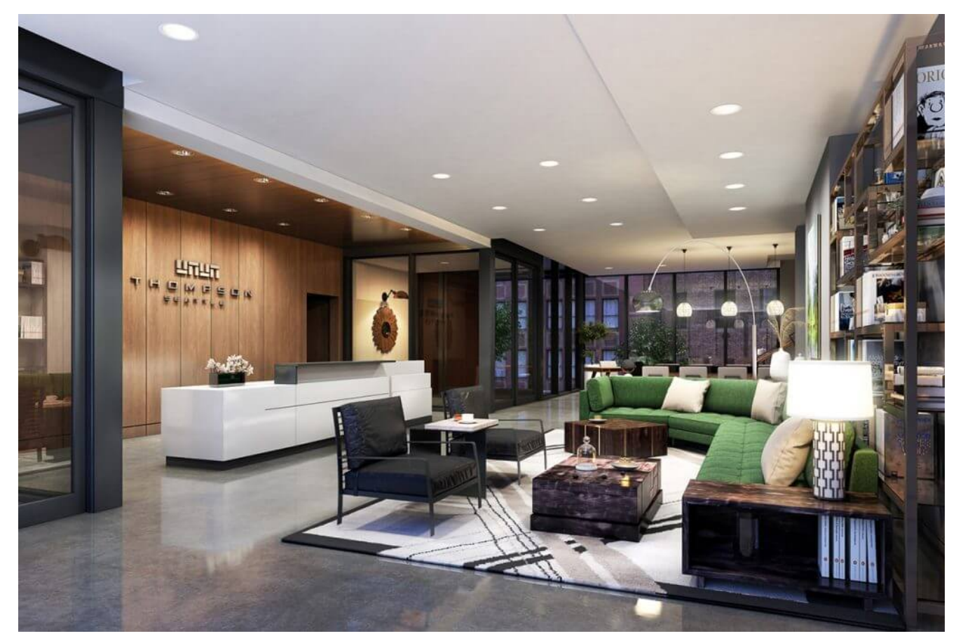
It's a cozy lobby, which feels nice and homey in (sometimes) overcast Seattle

The rooms are well designed, albeit with cold bathroom surfaces, and the modern design has enough character to distinguish itself from the other bread and butter hotels such as the Hyatt or Westin.