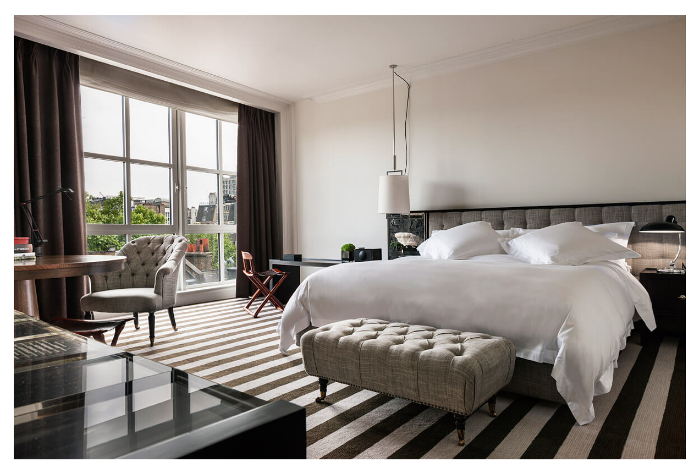
Impeccably finished rooms make you forget how small they are

My favorite part of the Rosewood, however, is Pearl. Pearl is the house Golden Retriever, and quite possibly the most quintessentially impressive part of this hotel. After hundreds of stays at different places, I have yet to come across a hotel with a house pet. The idea of it was so unique that it caught me off guard but made me smile every time I walked by Pearl and her bed right in the back of the lobby. Being a dog person, I thought it just gave that extra feeling of "special" to this unique establishment.