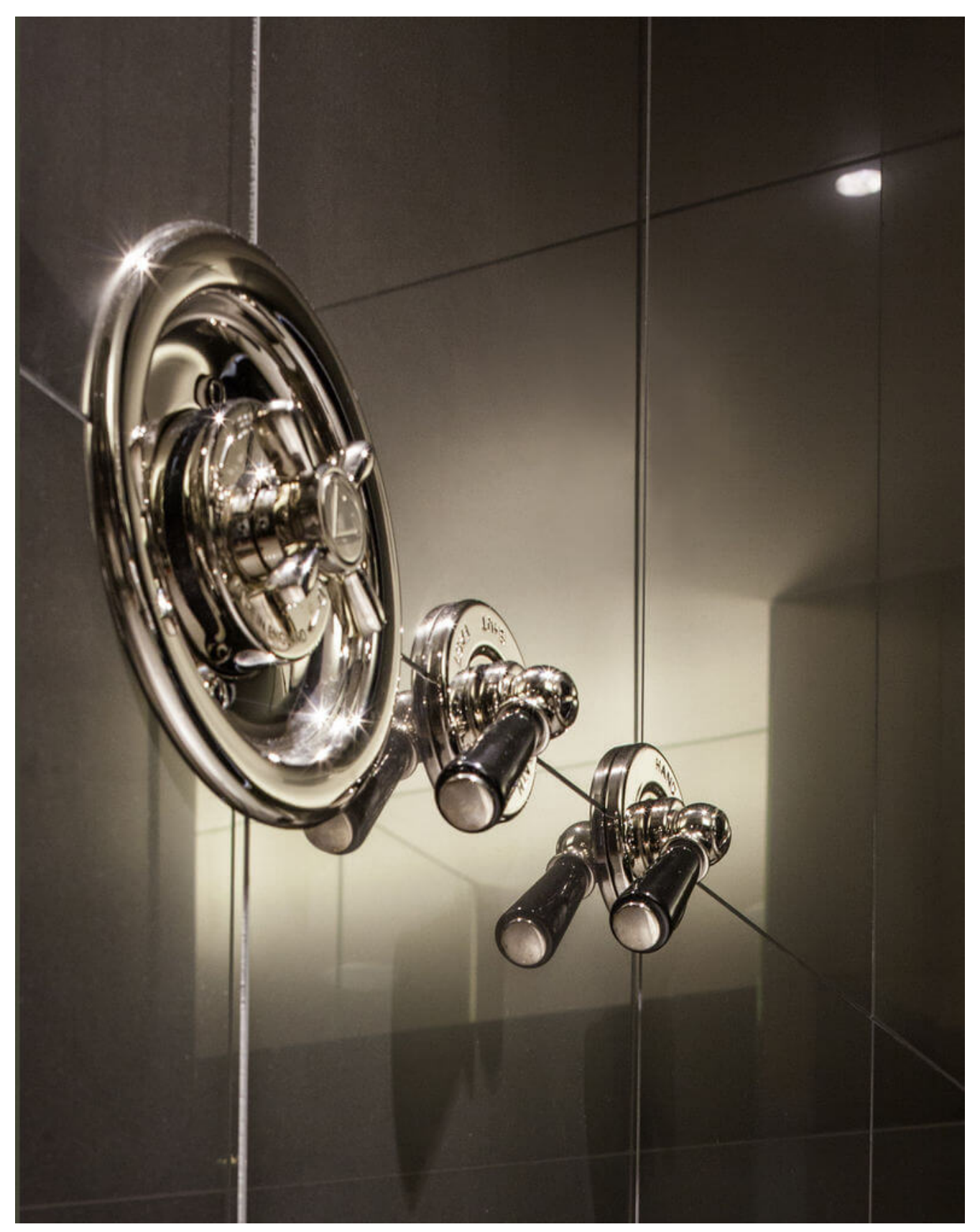
Small things like custom pearl finishes on the shower fixtures are what make this hotel exceptionally unique

The service, is of course, impeccable. I used the concierge service quite frequently and they knew everything from local