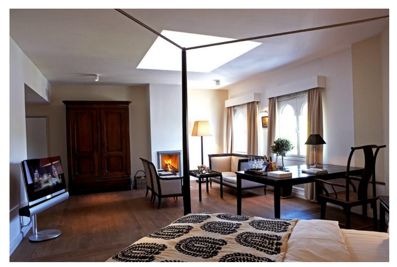
Any room with a fireplace is great in my book!

The rooms themselves also have fireplaces and so should you choose to use them, the front desk will send an employee to come open the flue and light it up for you. I highly advise visiting Copenhagen in the winter time — and though it's a city that is great year round, the holidays seem to have an extra abundance of Christmas spirit. There's a saying in Denmark which is called Hygge (it's the warm fuzzy feeling you get from good friends, winter sweaters, and a cup of hot chocolate), and there is nothing more Hygge than being at the Nimb with a glass of Glogg, sitting in front of the upper lobby fireplace, overlooking Tivoli Gardens.