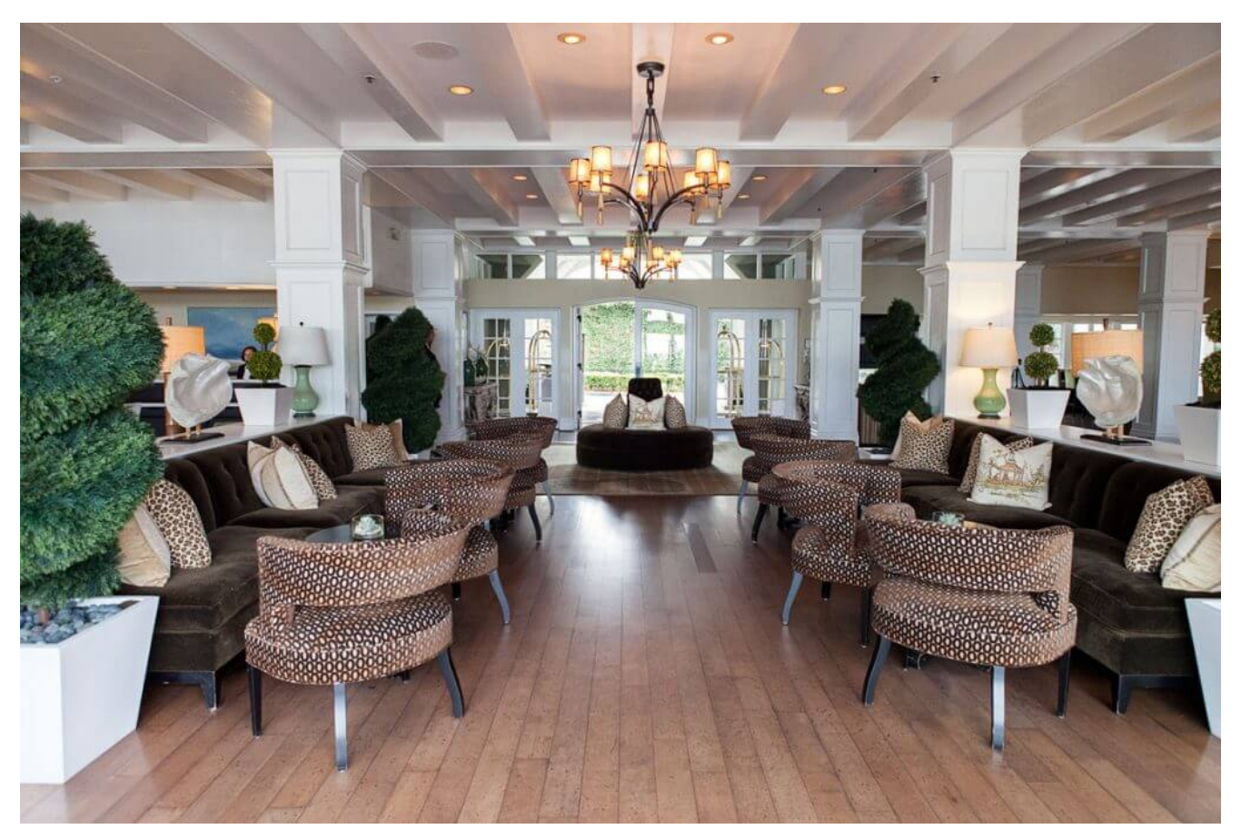
The lobby has a Martha's Vineyard vibe to it

One of my favorite stretches off of PCH happens to be the area South of Orange County all the way to San Diego. On the northernmost side of San Diego County is a little town called Del Mar, which was built for the "rich and famous". It's a quaint area with beautiful bluffs, white sand beaches, and gorgeous year round weather. There's a few of my favorite California hotels here as well, one being the L'Auberge, and the other being the Rancho Valencia. The L'Auberge is a cute little boutique hotel, with rooms overlooking the ocean, and restaurants and shops all within walking distance.