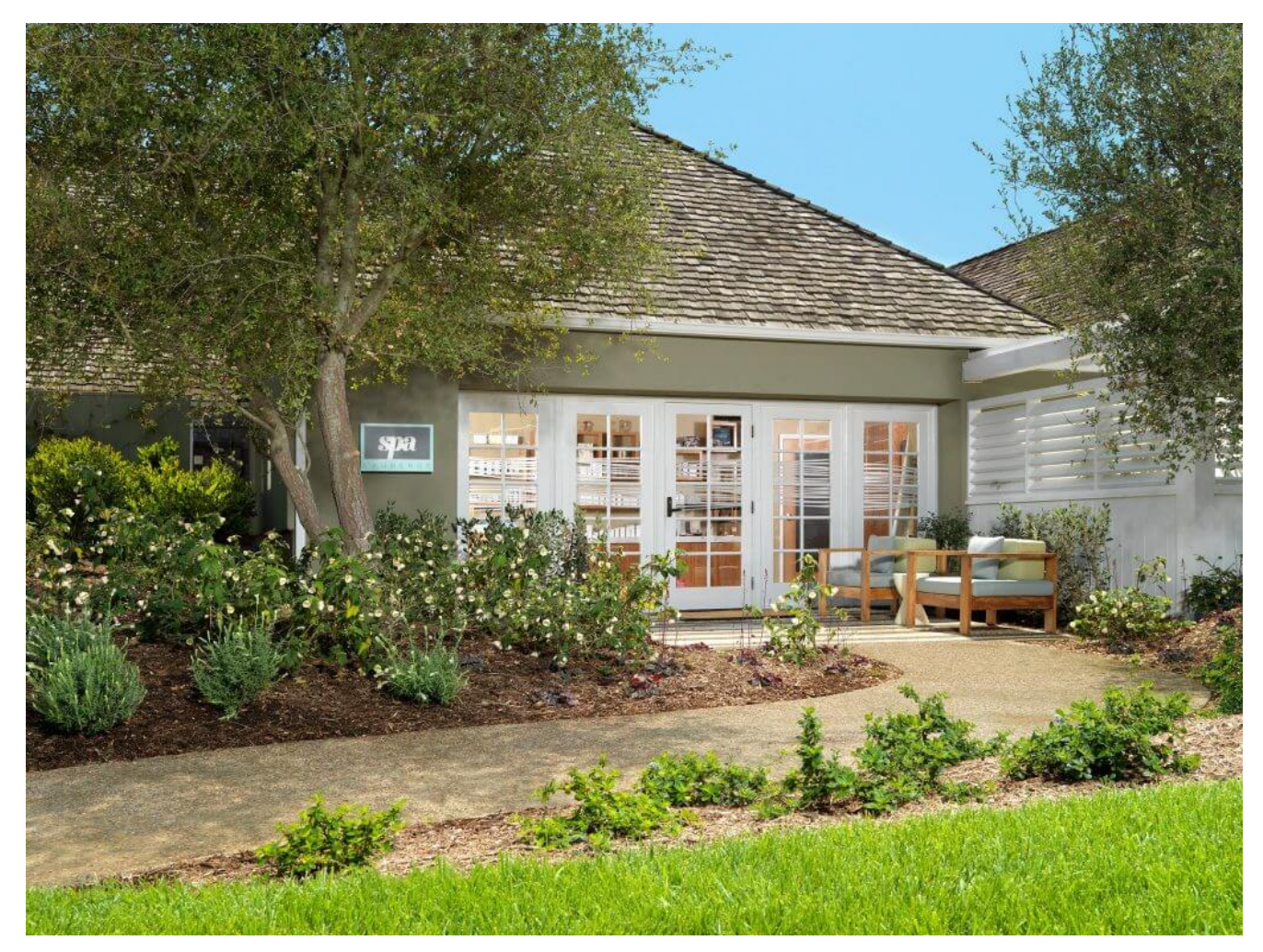
The spa is a hidden gem here