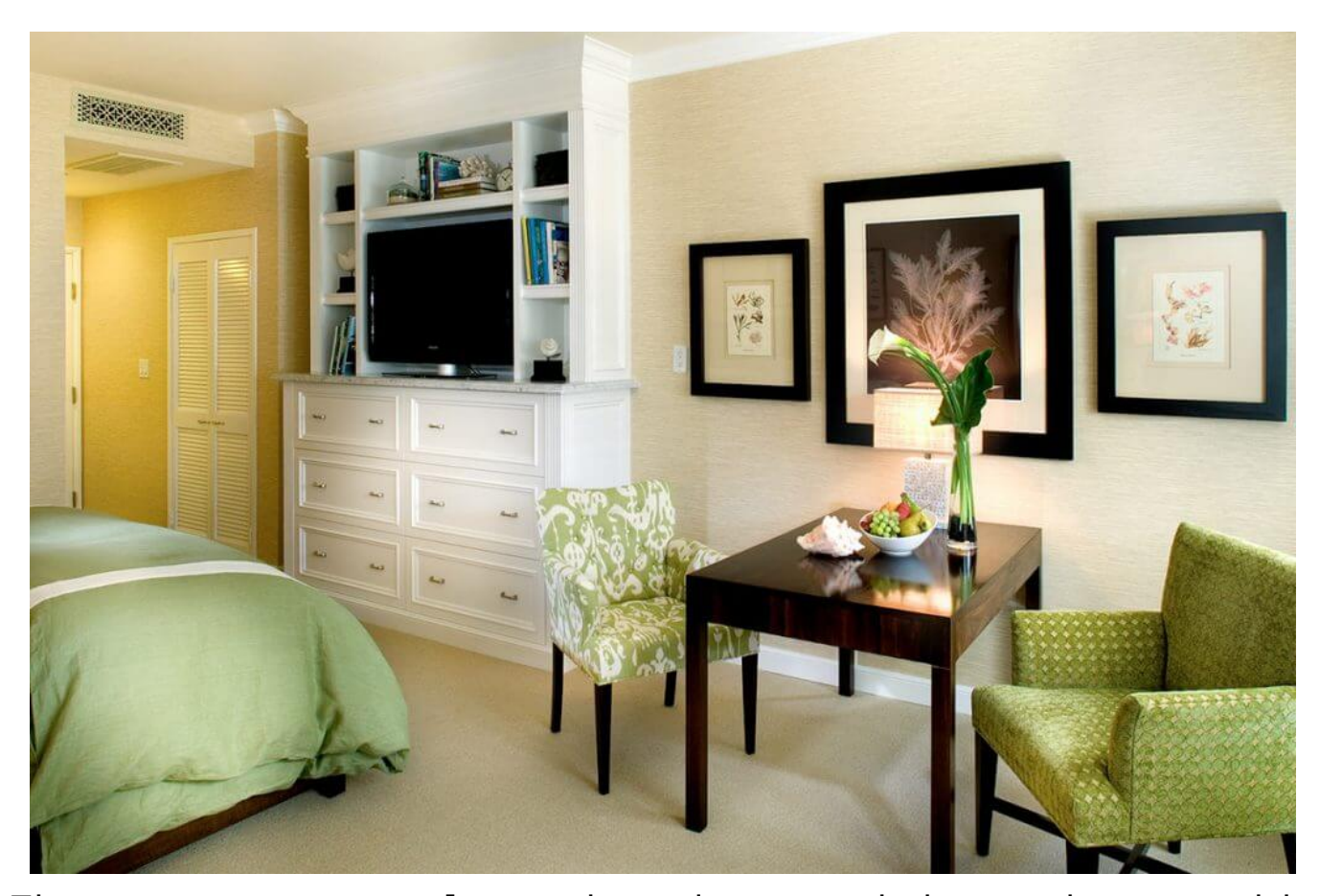
The rooms are not large but decorated in quaint seaside cottage manner

can't help but appreciate the vibe of the entire hotel. There are certainly hotels with nicer fixtures and finishings, but at the L'Auberge all of it comes together as a whole to provide a unique luxurious Oceanside experience without a hint of pretentiousness. The textured walls, lime green accents, and live flowers in each room really add to the overall atmosphere.