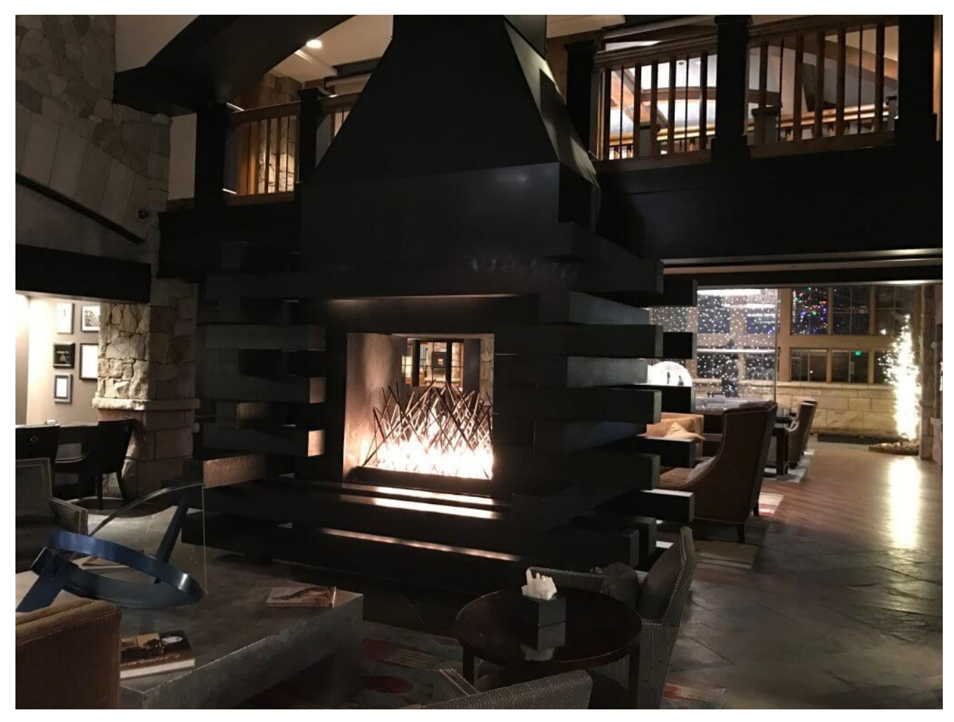
The lobby..yes its cozy

I really wanted to love the Sebastian — the timeless decor, the enormous rooms, the boutique touches. This is a boutique hotel done right (for the most part). Almost everything about this hotel was perfect except for ONE glaring issue I had. It was enough of an issue that it keeps me from recommending it over the Four Seasons in Vail. However, we'll get to that later.