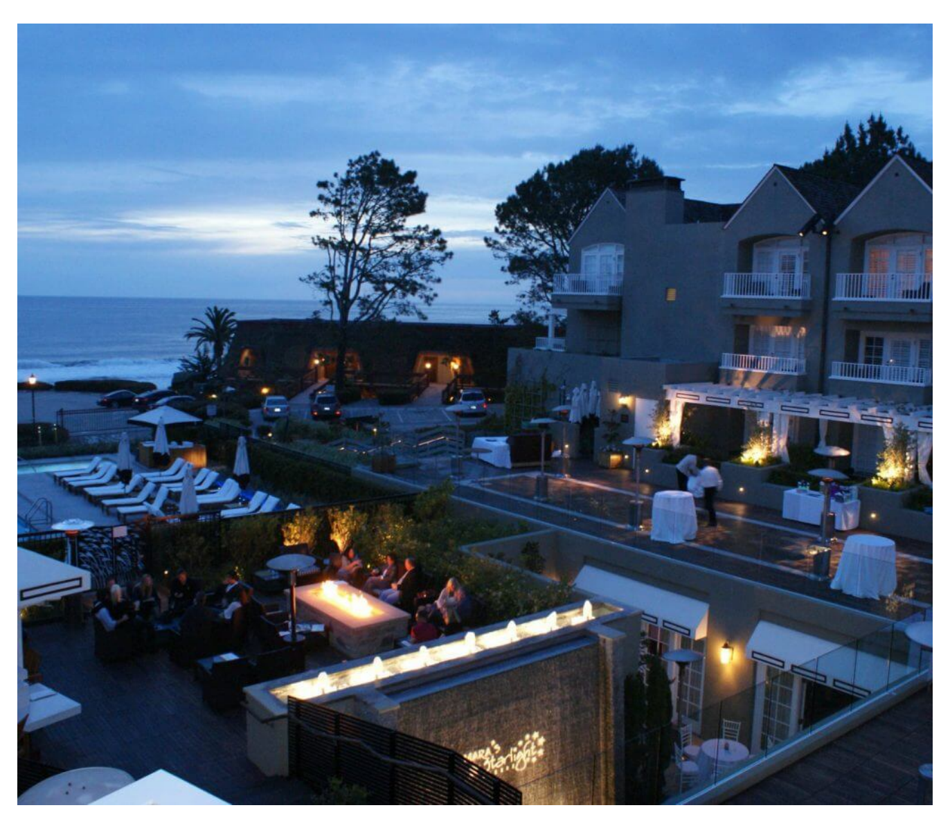
The pool which overlooks the ocean is a great place to relax and enjoy good company and a cocktail

One of my favorite things about this hotel is actually the spa. It's small and you'll have to book ahead to get a spot, but it's a separate building next to the main lobby that houses some of the most attentive and incredibly luxurious treatments i've had a boutique hotel. Their outdoor couples massage is highly recommended, and the tub on the patio completes that experience.