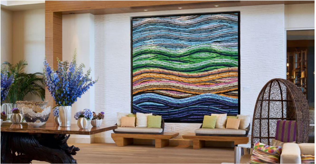
The lobby is graced by enormous windows and a tall ceiling, beautiful furniture, and the instant feel of a coastal vacation