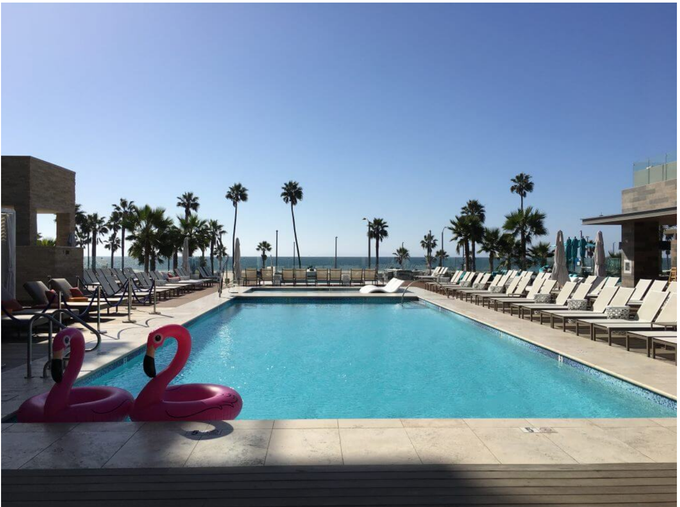
The Pool is gorgeous, and located directly facing the Ocean,