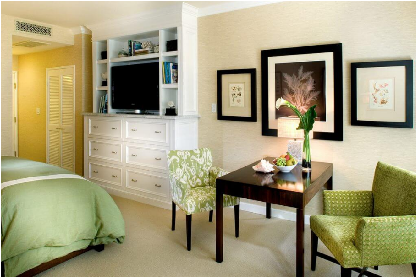
The rooms are not large but decorated in quaint seaside cottage manner