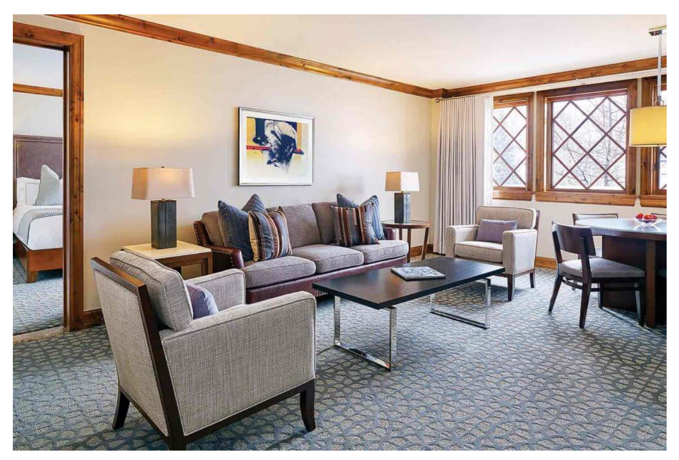
Beautiful decor makes you feel right at home

The location also couldn't be better, right at the heart of Vail village, you are only about a five minute walk from the base gondola, and within spitting distance of pubs, restaurants, and more shopping than your Amex will want to partake in. Everything is fine and dandy except for one VERY large problem I had. TERRIBLE room service. Half of the time room service didn't come to my room until 4PM. The other half of the time, they made glaring errors, like forgetting to pick up trash, neglecting to refill water bottles in the room, or taking my robe away without replacing it with a fresh one.