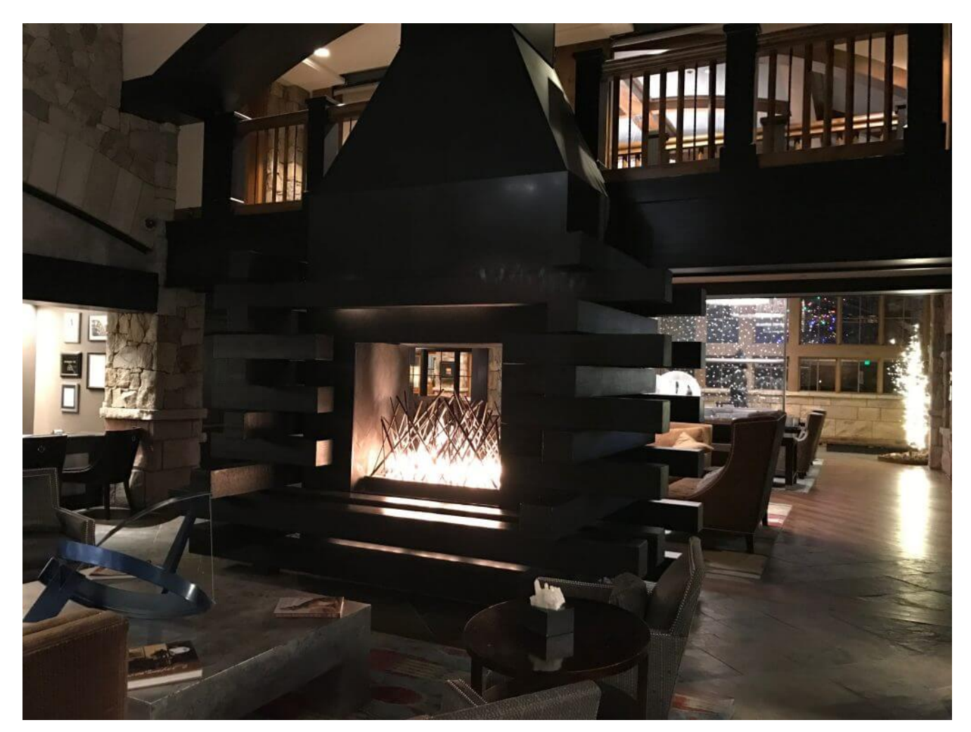
The lobby..yes its cozy

I really wanted to love the Sebastian – the timeless decor, the enormous rooms, the boutique touches. This is a boutique hotel done right (for the most part). Almost everything about this hotel was perfect except for ONE glaring issue I had. It was enough of an issue that it keeps me from recommending it over the Four Seasons in Vail. However, we'll get to that later.