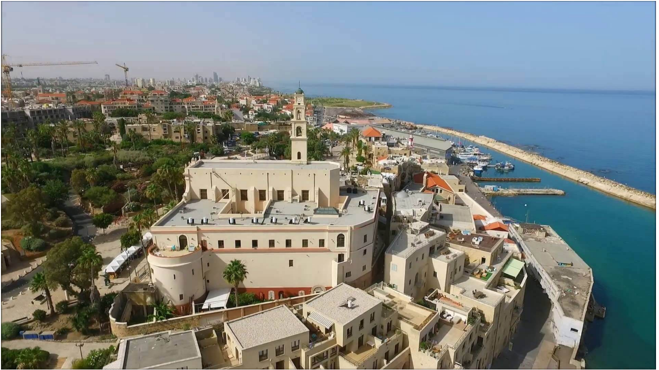
Jaffa Heights from my Drone's view

After quite a bit of walking and filming I realized that my next stop had to be for more food. After consulting Tripadvisor (which can be hit or miss – but still useful), I decided upon a place called “Ha’Pizza”. I had found based on my past few days in Jerusalem, that oddly enough – the Pizza in Israel was possibly as good or better than some of the best Neapolitan pizza i’ve had in the US in Brooklyn. I was told that this was because of the unique soil in the region and the resulting freshness of the grown tomatoes. As to whether this is true or not I’m not sure, but the pizza was damn good.