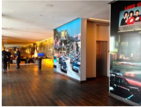
The minimalist lobby, notice the check-in “stands” in the distance

The hotel itself is a smaller property, but that’s because the Andaz believes that this property is all about the location around it and they don’t expect you to spend a lot of time within the hotel. There is a restaurant on the side of the lobby, which is beautiful, but rather expensive. It’s not a bad place to grab a bite, but I would recommend checking out everything else that Los Angeles has to offer – it IS the foodie capital of the US.