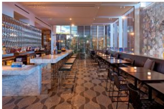
The lobby restaurant is gorgeous AND expensive

The hotel itself is a smaller property, but that’s because the Andaz believes that this property is all about the location around it and they don’t expect you to spend a lot of time within the hotel. There is a restaurant on the side of the lobby, which is beautiful, but rather expensive. It’s not a bad place to grab a bite, but I would recommend checking out everything else that Los Angeles has to offer – it IS the foodie capital of the US.