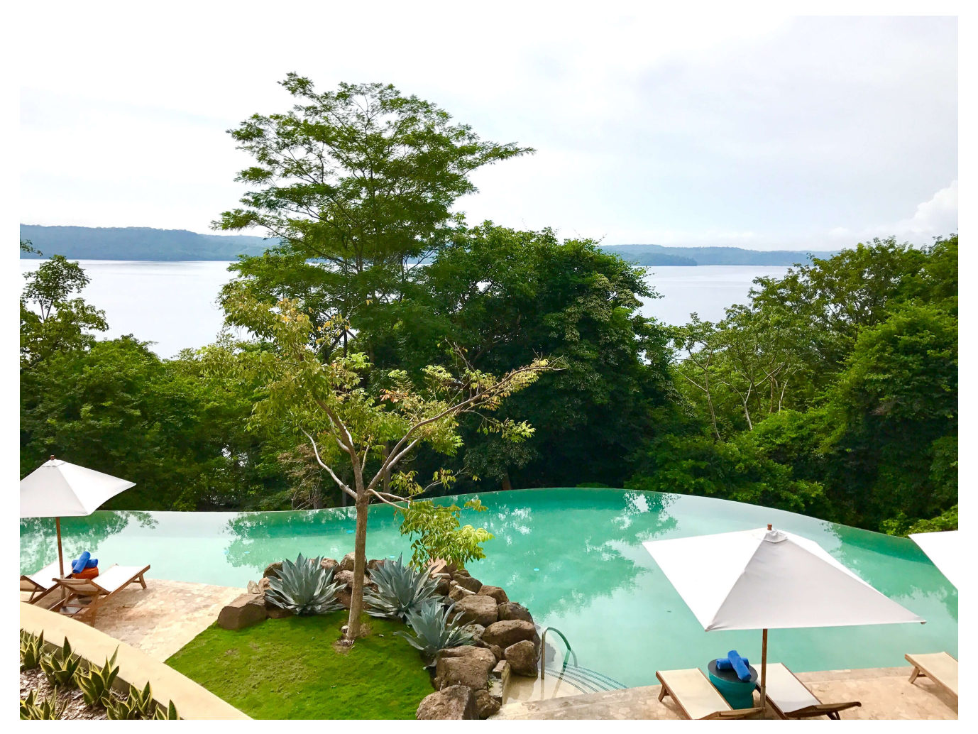
This is the view that you'll be seeing every morning as you have an amazing breakfast

Staying at this hotel was one of the best experiences I have had in a while. I know, it may sound like hyperbole, but the Andaz really knows how to do things right when it comes to their resort in Costa Rica. I was lucky enough to stay here during low season which turned out to be a blessing in disguise as the resort was exceptionally placed and relaxing with only a few people around.