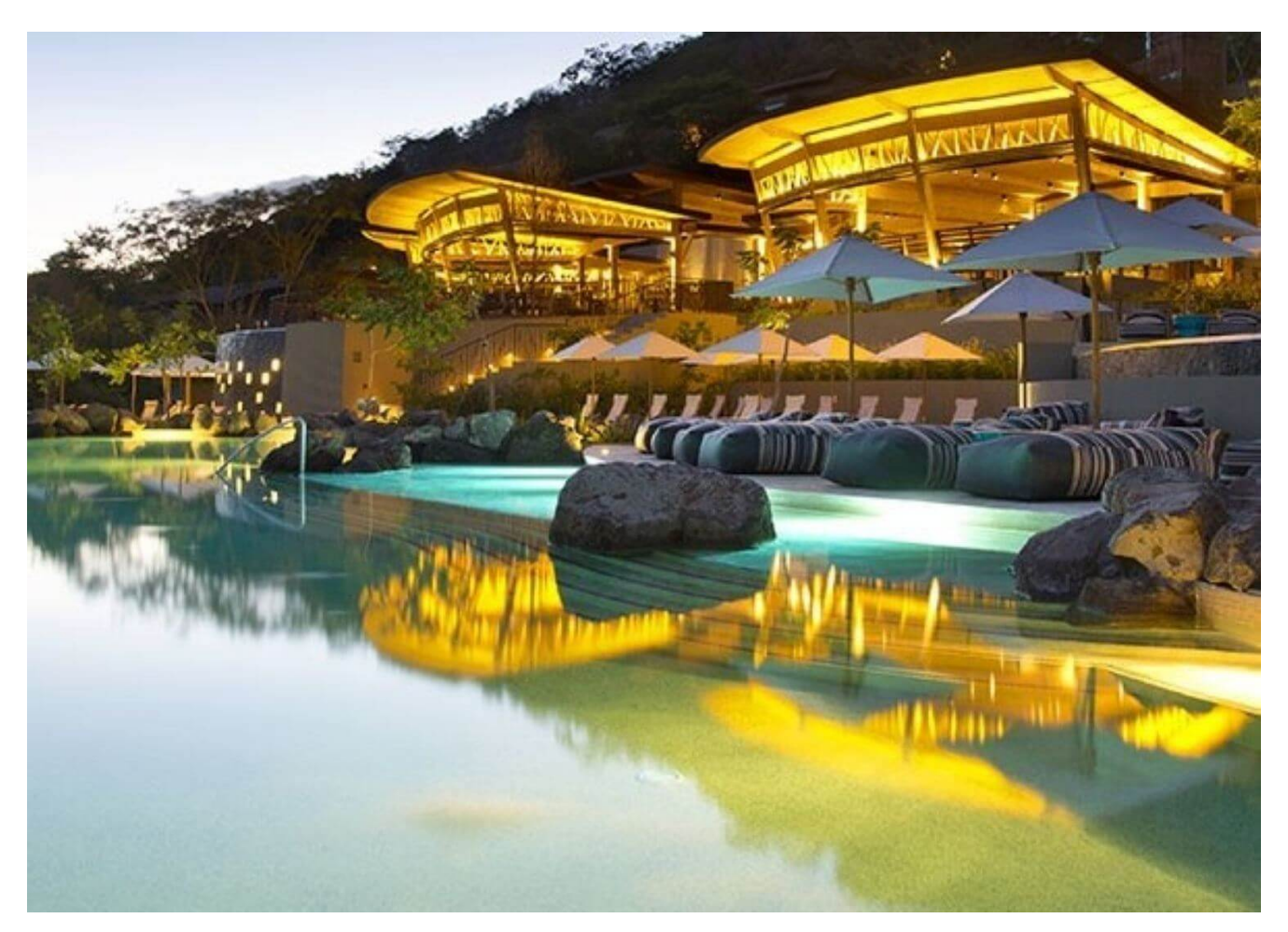
Modern, relaxing, and awesomely integrated into the mountainside — Big ups to the Andaz hotel chain for this one!

The staff went out of their way at each moment to know the names of the guests, to know my personal preferences in drinks and food, and to impart some personal tidbits about Costa Rica — once they knew it was my first time there. The concierge was extremely helpful in planning activities, and one of my favorite things about the resort was the mixology bar and the mixologists on staff. The complexity and innovation that went into some of the beverages that the staff made for me was almost incomprehensible (yes, it's that good).