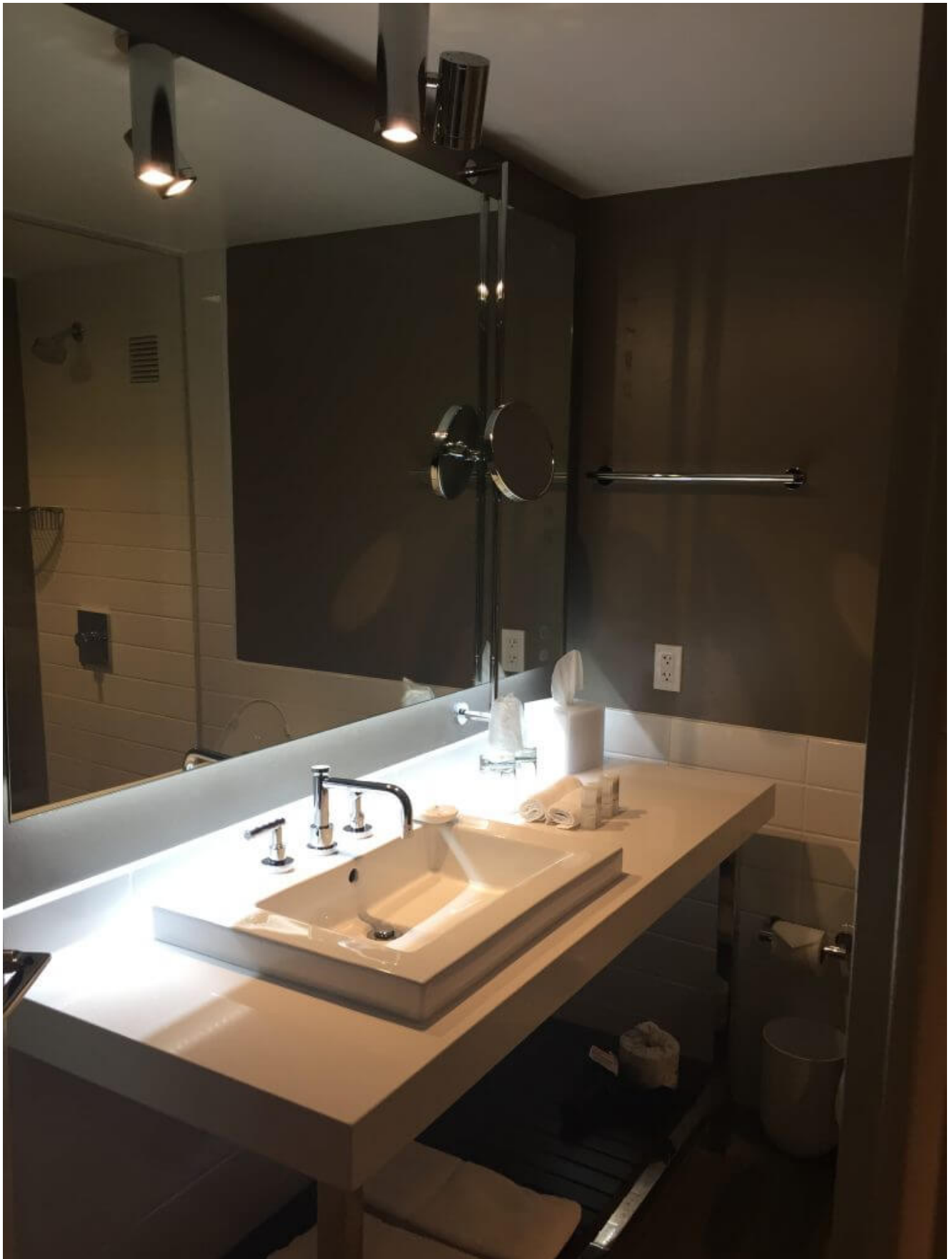
The very sexy renovated bathrooms – if you can't tell i'm a big fan