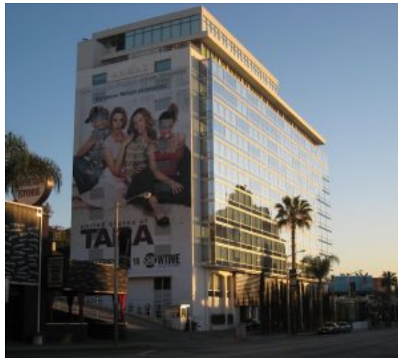
The view from Sunset Strip (Your ad on side of building may vary)

I've stayed at nearly every hotel on Sunset strip, and most of them are pretty unique in their own way. The Andaz West Hollywood stands out for being the most modern and updated of the properties on the strip, and whenever someone asks for a recommendation for something modern this is where I send them.