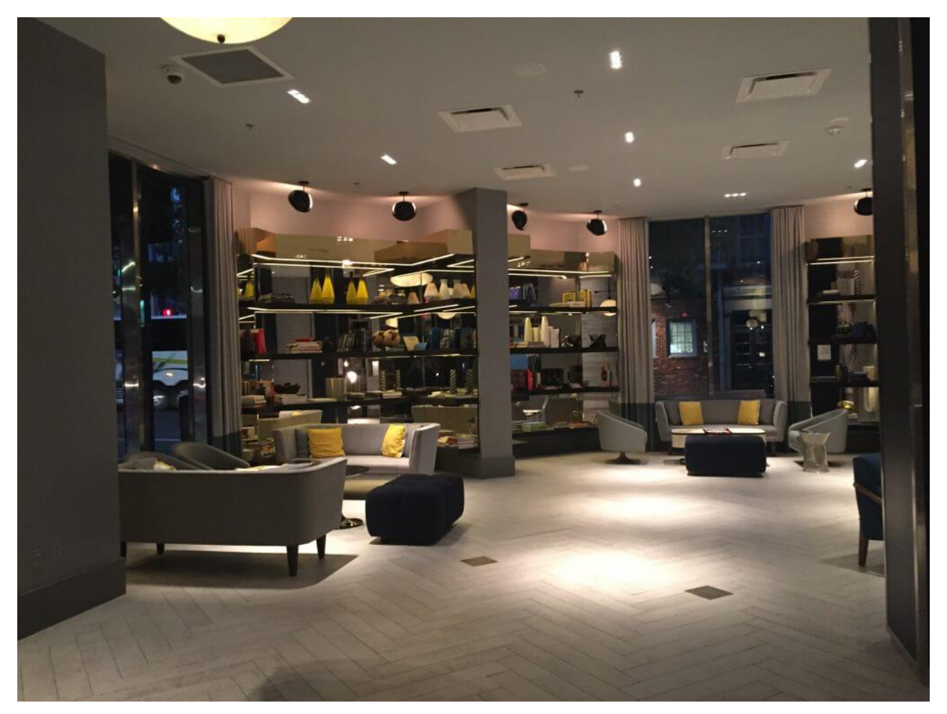
Yup. That's an awesome lobby area too. Cozy, visually interesting, and thoroughly relaxing

The rooms themselves have gone through some pretty significant renovations. They have beautiful bathrooms in particular, with minimalist countertops and low edge sinks — my personal favorite. The building itself is pretty tall and centralized, next to the Harrah's casino and only about 5 blocks away from Bourbon street.