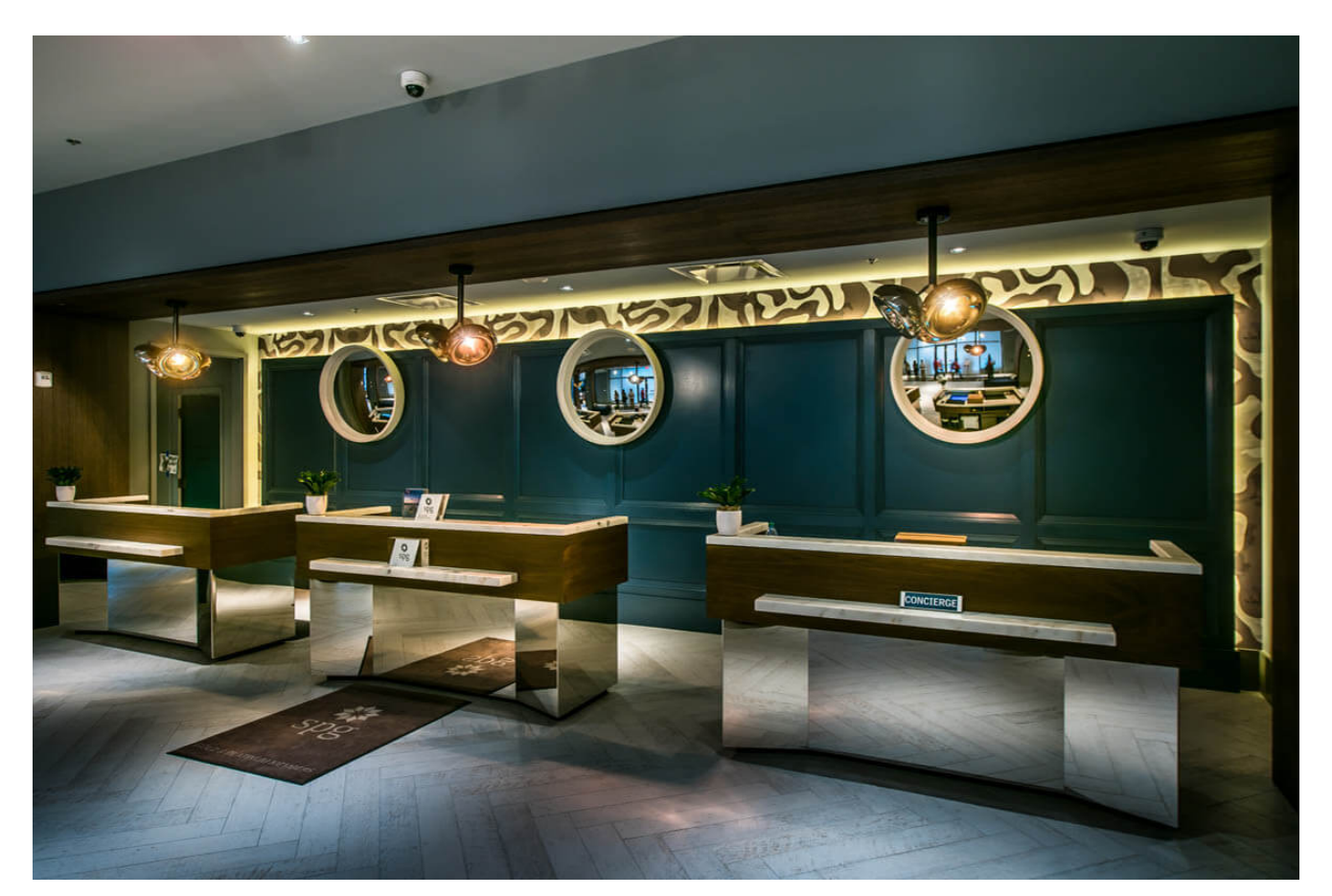
This is the front desk. It's nice.

You are greeted by stunning textures, surfaces, the combination of marble, antique wood, and mirrored surfaces is something that is a nice juxtaposition from the city of New Orleans, which itself has lots of character, but is older and antique in character.