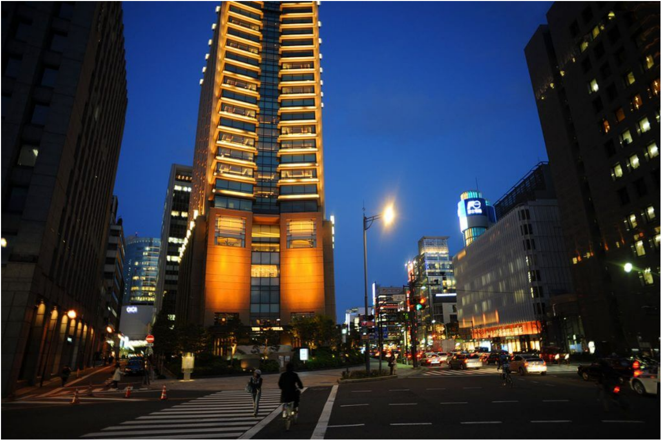
Right in the heart of Ginza!