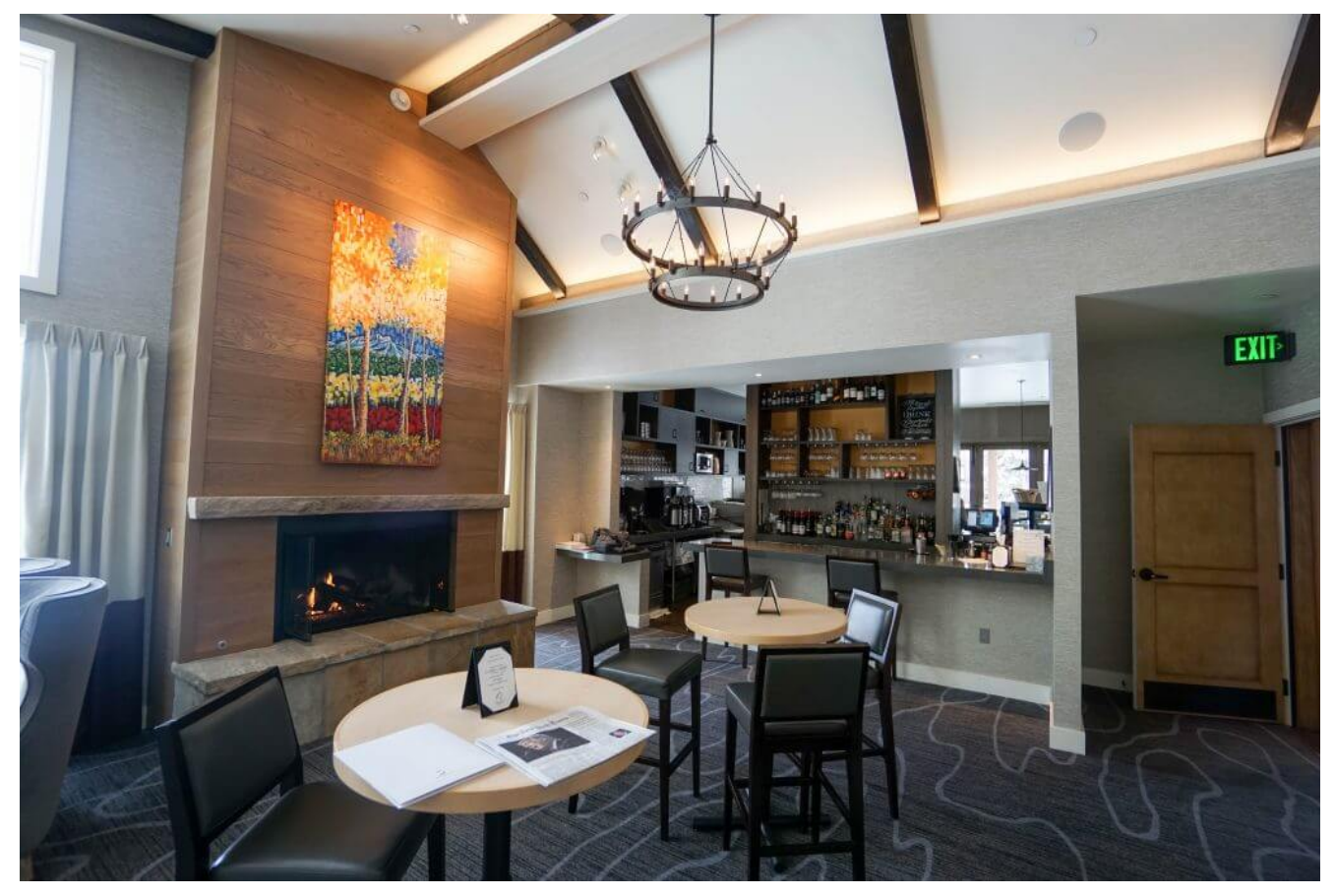
This is where you'll be unwinding with a cocktail at the Gant!