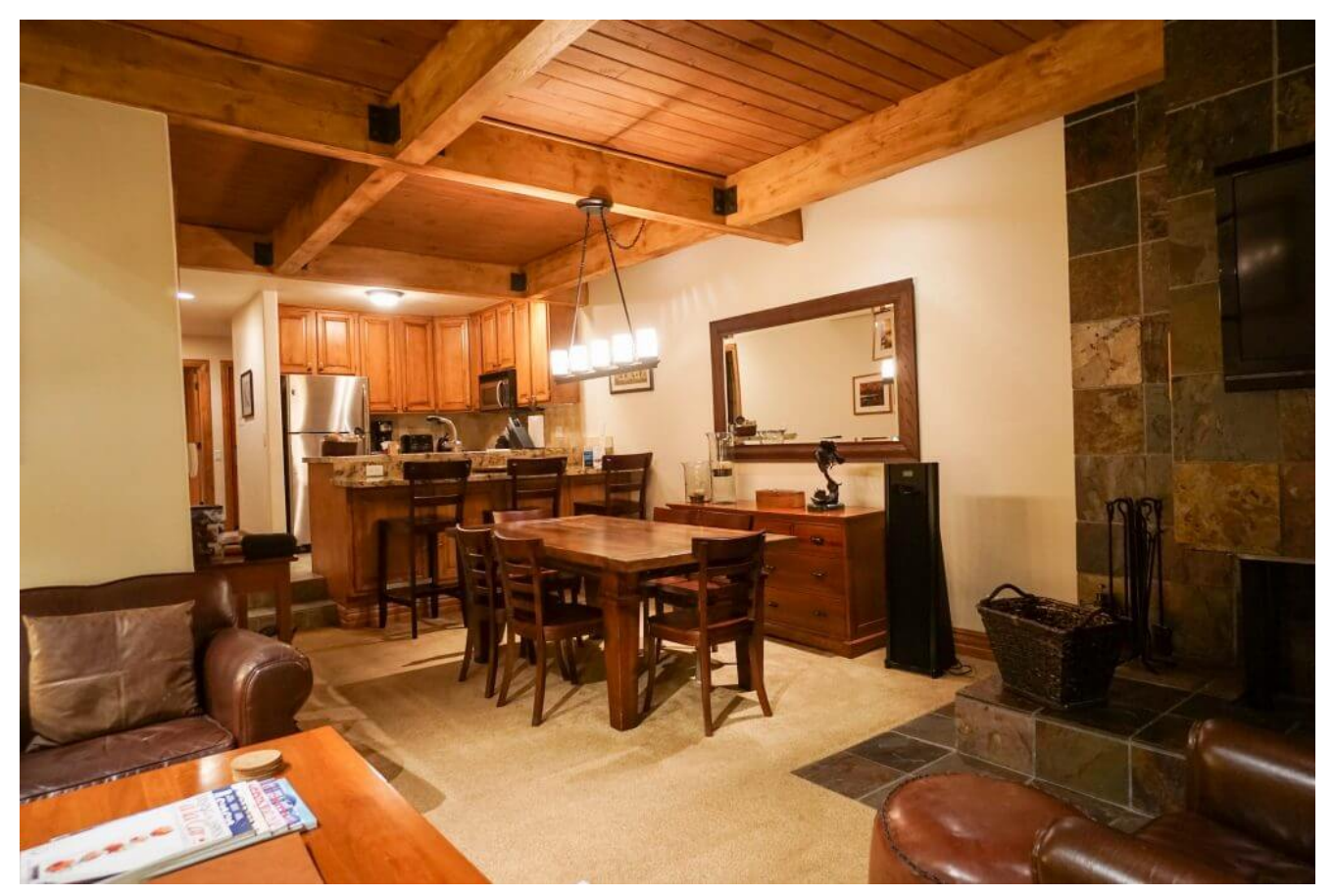
This is the Standard Tier Condo Finish