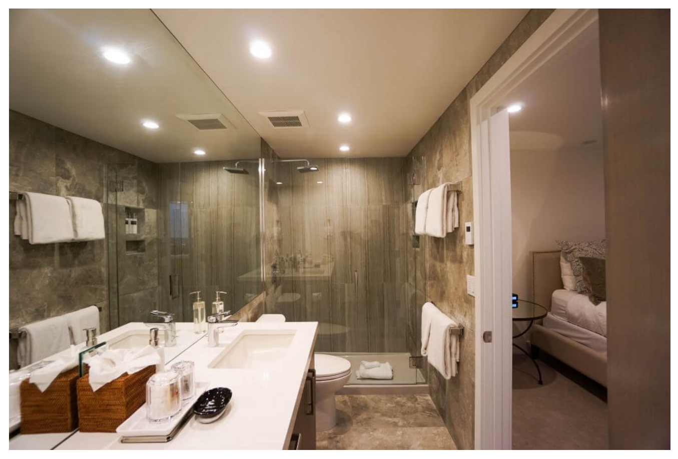
The Premier unit bathrooms were plain gorgeous

Differences in materials aside, all of the units have real fireplaces, full kitchens, and all the amenities you would want in a ski-worthy condominium. That includes a washer/dryer in most units, a heated room for you ski gear, and great living room spaces to relax and spend some quality apres-ski time in.