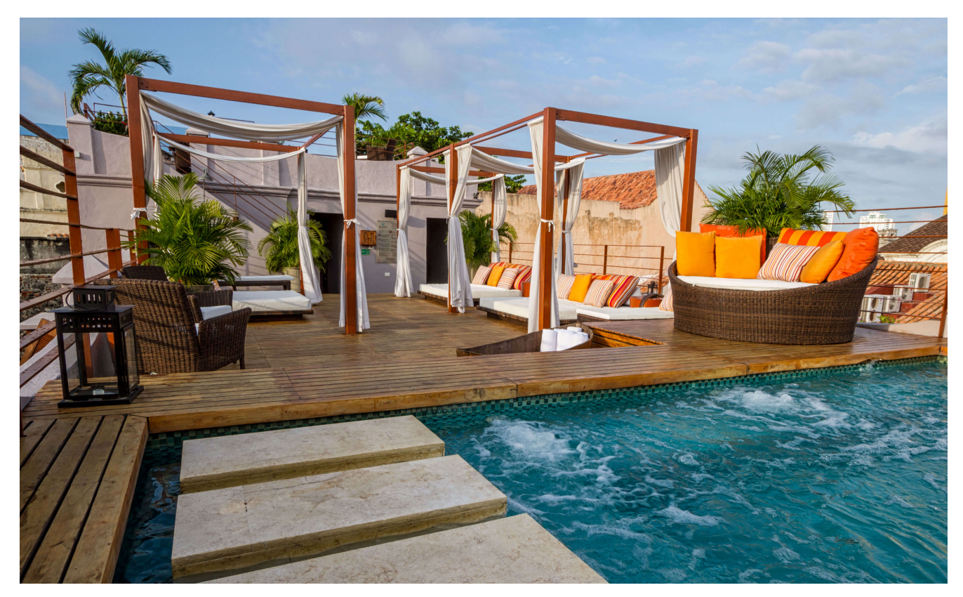
The Rooftop pool is where you'll find yourself spending some lazy hours relaxing

There's only one other option that is similar to the Ananda Boutique and that is the Bastion Luxury Hotel. I'd cross shop the two when you're booking but if there's one thing that I would say to swing one towards the Ananda it would be that the highest rated restaurant is in the lobby of the hotel. It's one place I highly recommend eating at, but skip the breakfast, it's terrible.