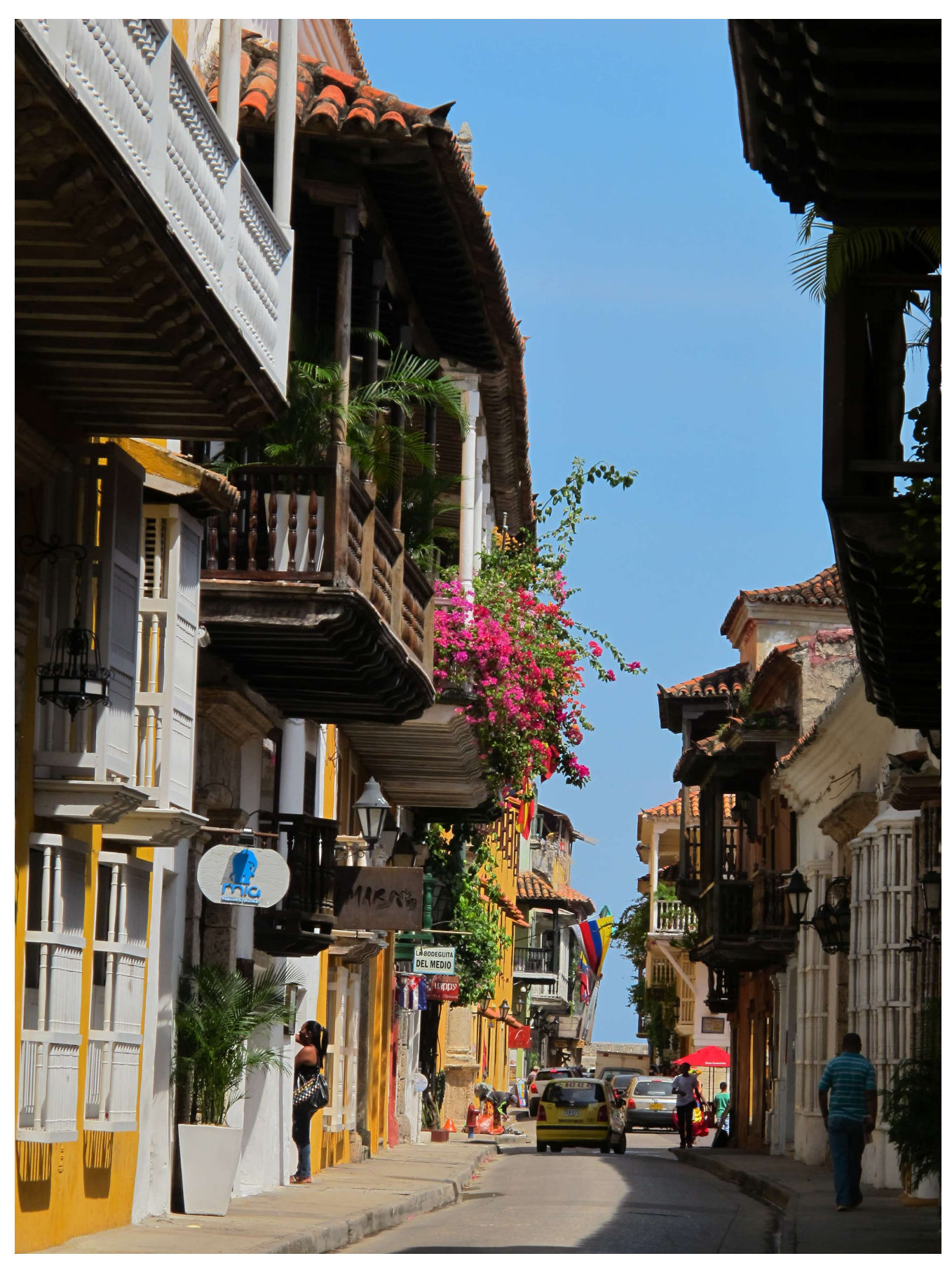
The hotel's there, its just hidden really well

Heritage Site. Well, that's the Ananda Boutique and that's Cartagena.