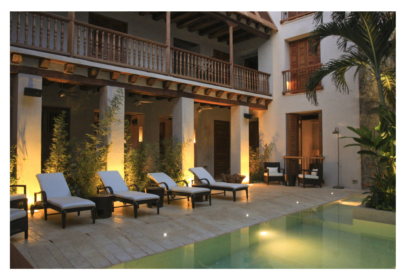
Options Options, downstairs or upstairs pool?

The first thing you notice about this hotel is how hidden it is. Much like the other hotels in Cartagena's walled city, Ananda is built right into the buildings around it and blends in. When you step in, however, you feel as if you're in a separate world. It's calm, there's trees and a little courtyard for the restaurant and a dipping pool on the first level. The hotel doesn't have many rooms, and the insulation is not so great in between rooms, but for everything is tastefully decorated, the exposed wooden beams and the refinished stone surfaces give the appearance of a modernized-400 year old hotel.