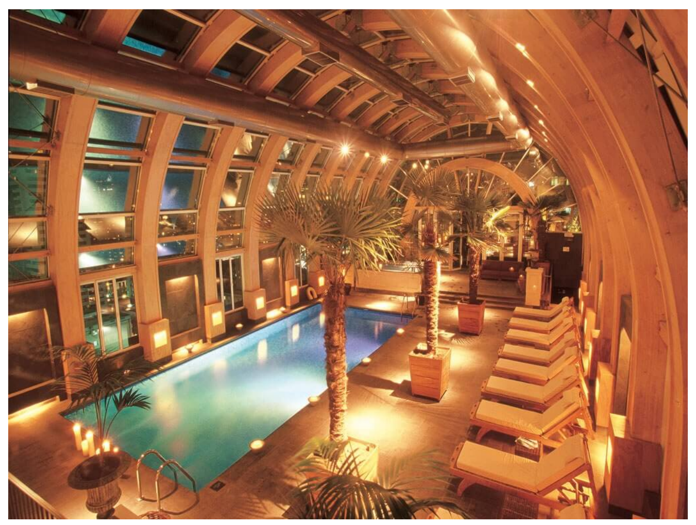
The rooftop indoor pool

So let me start by saying, I had really high expectations for this one. I had just come in from the Four Seasons in Buenos Aires which was a newly renovated hotel with great rooms and service, and was expecting the Santiago Ritz to be on the same level. Unfortunately, it left me wanting for a few reasons.