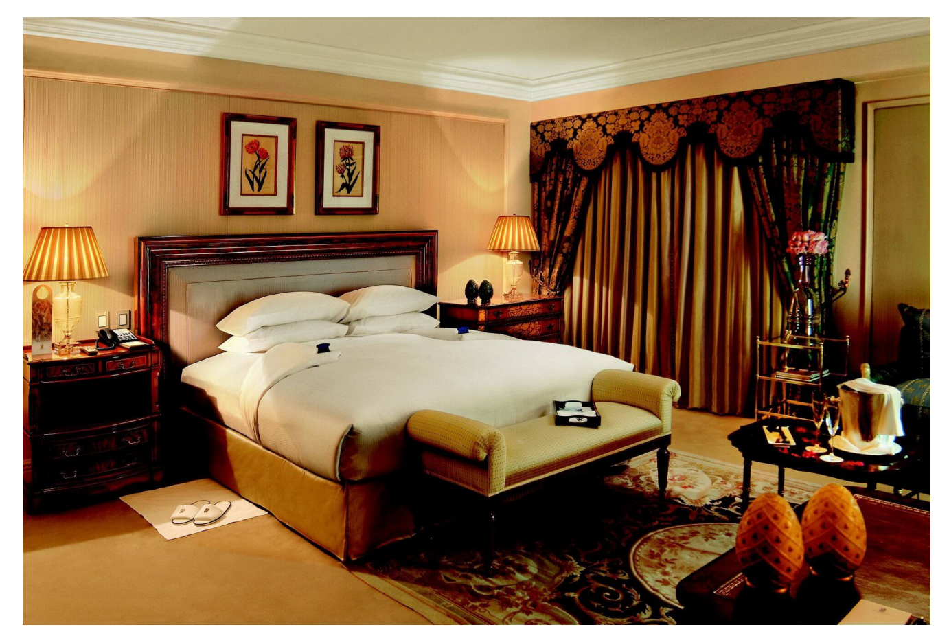
The stock room photo looks enticing, but don't be fooled. Lots of contrast image processing here