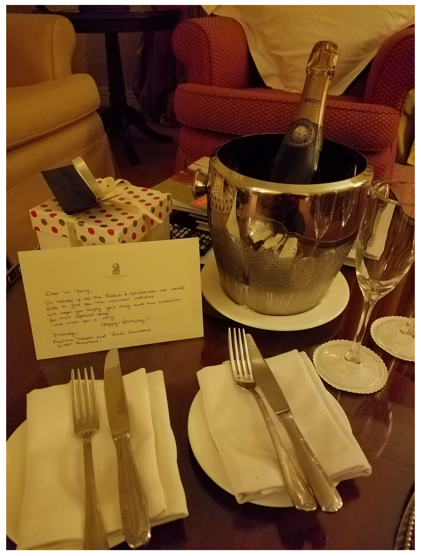
The Ritz Carlton Service - Birthday cake and champagne for my birthday and a nice handwritten note