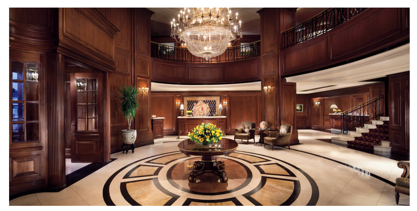
The impressive lobby

Upon closer glance, however, you find that the hotel needs some updating. The carpets are well worn, and the rooms themselves left quite a bit to be desired. The room that I was given had mold in certain areas of the bathroom, and there was an effervescent musk in the room as if it had been around for too long without a renewal or upgrades.