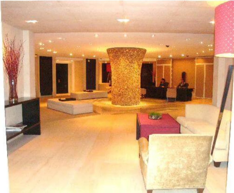
The separate upstairs lobby for the Skylofts @ MGM Grand

The whole thought behind this hospitality play is that a private boutique luxury experience can be had while still giving the customer access to the benefits of a large hotel (the MGM itself). This is what I really love about the Skylofts, along with the elegance of the design, there's a lot to be said about the quality of service that the private concierge provides for each guest, and the unexpected luxury of having a few drivers dedicated to the SkyLofts guests. Las Vegas, is of course, a city built on excesses, but here the SkyLofts really shine and provide an unparalleled experience which I've only seen on a similar scale at the Wynn Fairway Villas.