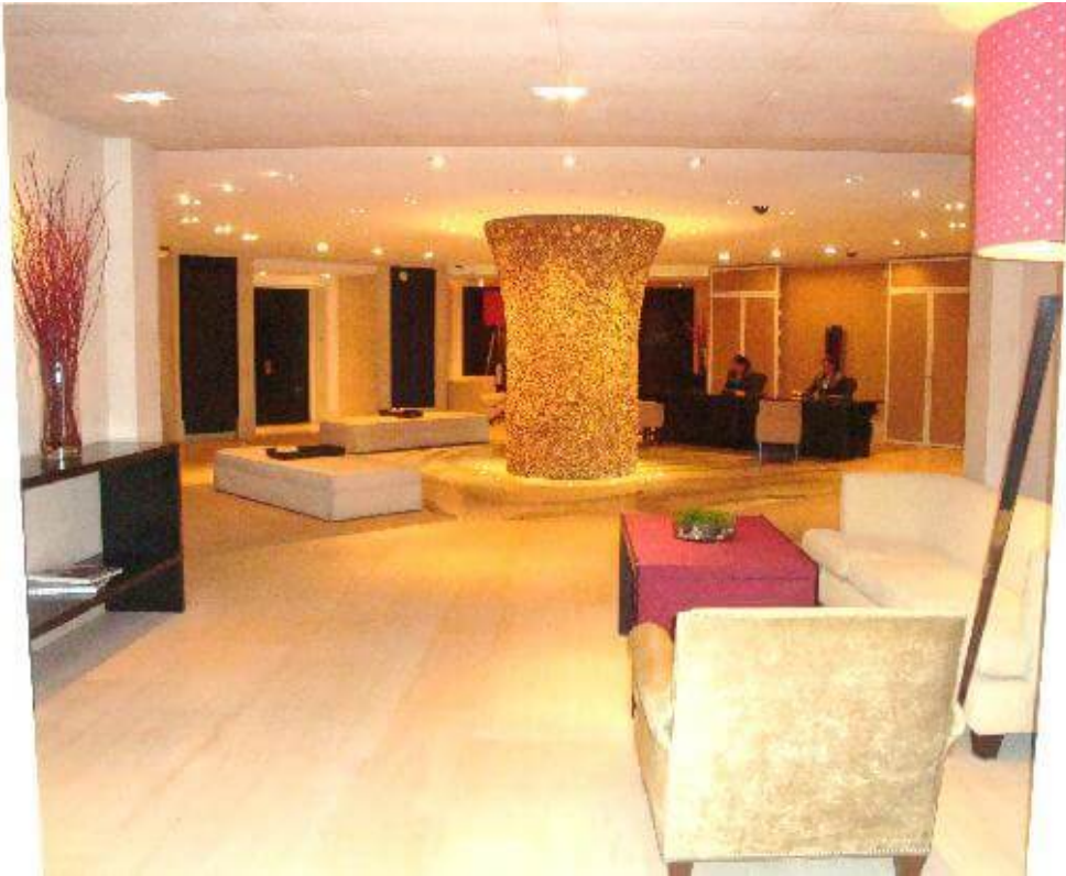
The separate upstairs lobby for the Skylofts @ MGM Grand

The whole thought behind this hospitality play is that a private boutique luxury experience can be had while still giving the customer access to the benefits of a large hotel (the MGM itself). This is what I really love about the Skylofts, along with the elegance of the design, there's a lot to be said about the quality of service that the private concierge provides for each guest, and the unexpected luxury of having a few drivers dedicated to the SkyLofts guests. Las Vegas, is of course, a city built on excesses, but here the SkyLofts really shine and provide an unparalleled experience which I've only seen on a similar scale at the Wynn Fairway Villas.